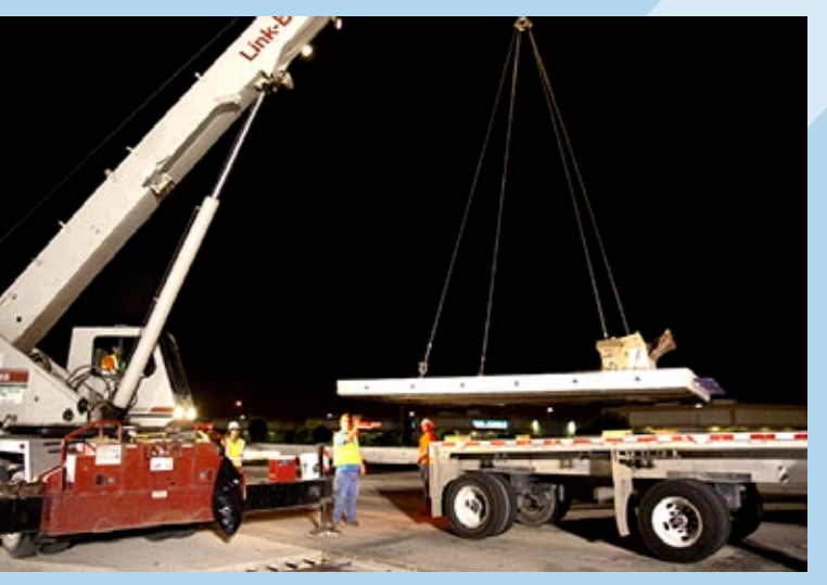
Participants in a Highways for LIFE showcase in California watched the nighttime installation of precast concrete pavement panels.

Transportation professionals who attended a showcase demonstrating innovations used on a Highways for LIFE