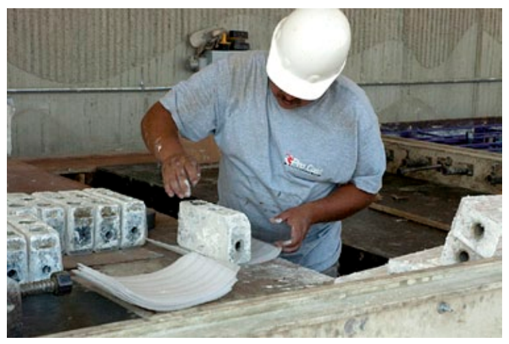
Showcase participants visited a plant to see how concrete panels are made.