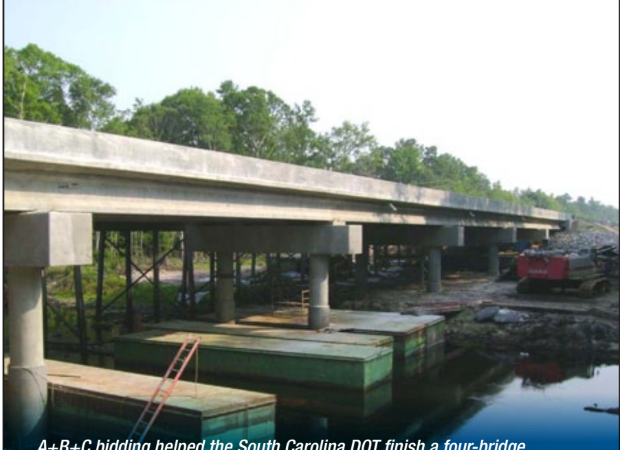
A+B+C bidding helped the South Carolina DOT finish a four-bridge replacement project in half the time needed for traditional methods.

Two work zone-related crashes occurred during construction, below the preconstruction crash rate of 19