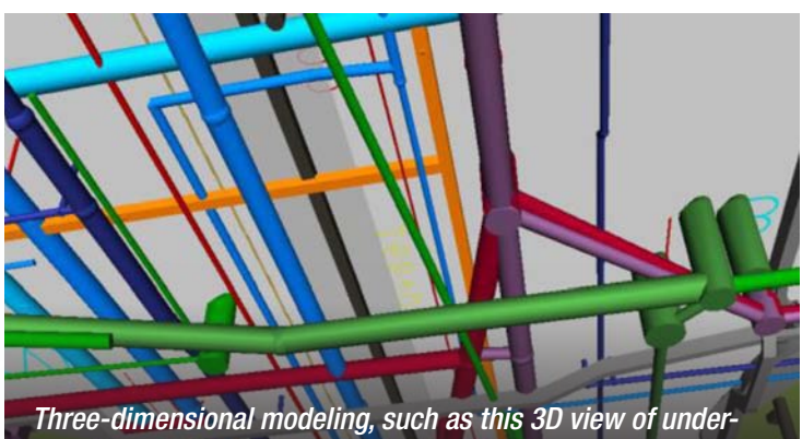
Three-dimensional modeling, such as this 3D view of under ground facilities, enables highway designers to design and simulate projects in the virtual world.