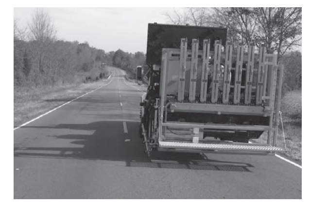
The automated pavement marker placement system fits on a truck and eliminates the need for a worker riding under the truck to apply markers by hand.