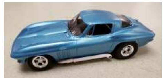
A Revell '65 Corvette in Mulsane Blue lacquer