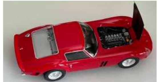
"This is the Fujimi Ferrari 250 GTO, a very detailed kit but very fiddly when it comes the assembly, especially when you get a nice smooth finish and then have a bunch of small chrome bits to attach."