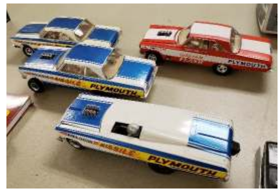
Dave Green has multiple Melrose Missile cars – a Super stock, the Model King altered wheelbase, the no-top roadster as well as California Flash