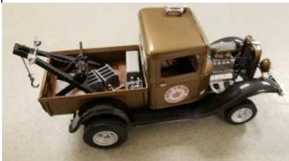
George also had a '29 Ford tow truck with using a '62 gasser chassis and motor

George had a Aoshima Lambo in the works using a gorgeous metallic green paint with stripe put in using clear flat - cannot wait to see finished product