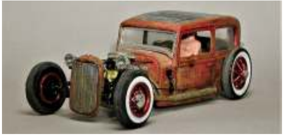
This was a fun build and something where the paint job took the most time.

I call the paint job 50 shades of Red. The rust color is old Floquil Polly Scale rust. The roof is Tamiya rubber black with a wash of Floquil Polly Scale dust. The entire weathering is hand painted with various shades of red.