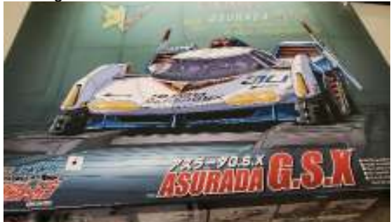
Doug is working on an anime Formula 1 type car. Car molded in four colors and a hybrid snap/glue car. I will be building them all a great kit.

There was a regular in person meeting again, on Saturday, March 6, at the Algonquin Township Building.