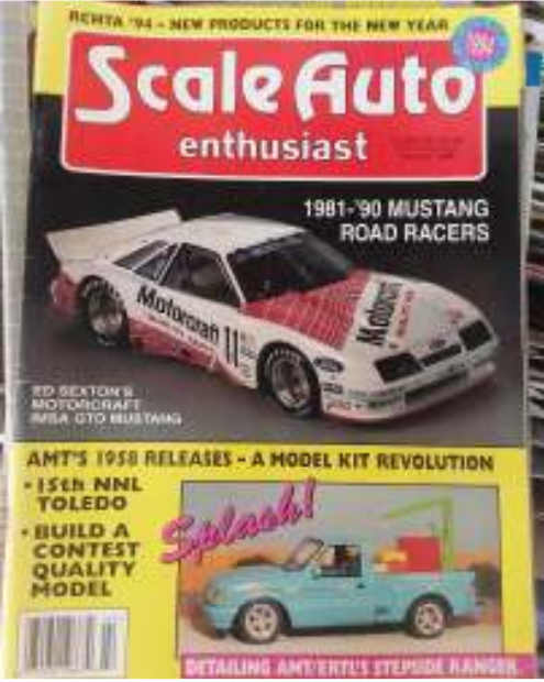
While going thru an estate collection from a deceased member of the Albuquerque Model Car Club, in the stack of old SAE magazines I came across this one (No95, February 1995) that includes a feature on a Revell Trans Am Mustang built by our own Ed Sexton