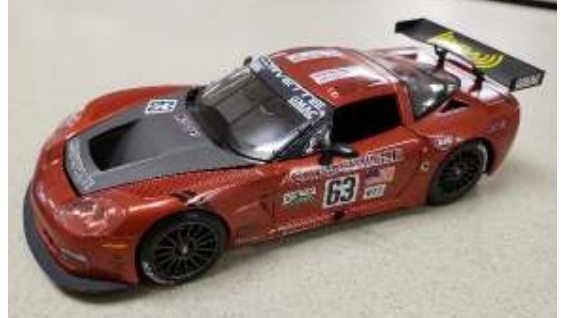
The latest C6 race Corvette from Revell. This is a phantom color [Sunset Metal Red lacquer] in Compuware livery. Hood is painted to simulate Carbon Fiber.