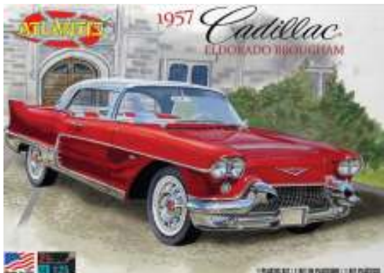
This is the artwork for the upcoming 1957 Cadillac kit.