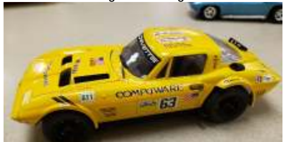
Doug had a few Corvettes. This one is an Accurate Miniatures Grand Sport in Compuware livery. Car still sits too high but the hood louvers are way too cool.