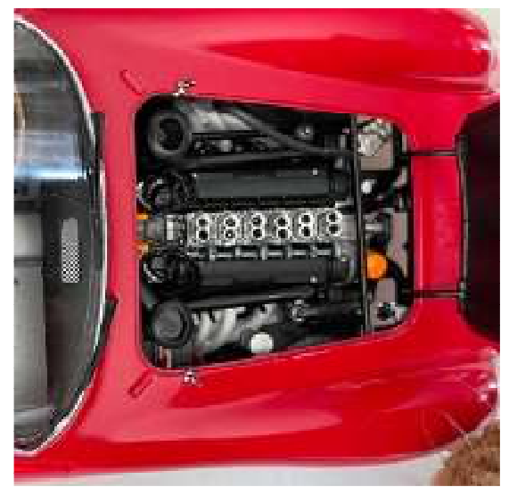
"Had given up on this when I busted up the suspension trying to squeeze the wheels on. Came back later with a cooler mind and was able to fix her and finish it. I've learned to treat red Ferraris with a lot of respect!"