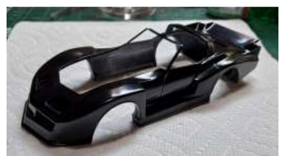
"And my mind is made up. I'm going to sand this bad boy and give it a coating of Black Pearl."