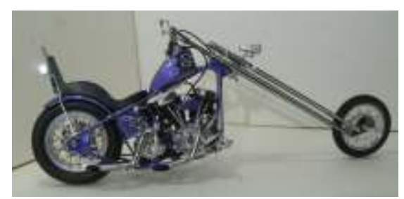
"Just completed one I named the "Scavenger": Began with an old LA Chopper kit I picked up at a toy show. She was missing a few parts and had a couple of broken parts but was able to salvage her by "scavenging" some parts from my parts box.