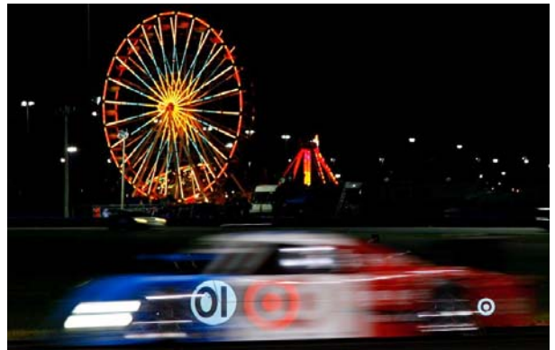
Scott Pruett, Juan Pablo Montoya and Salvador Duran won the Rolex 24 at Daytona last month.