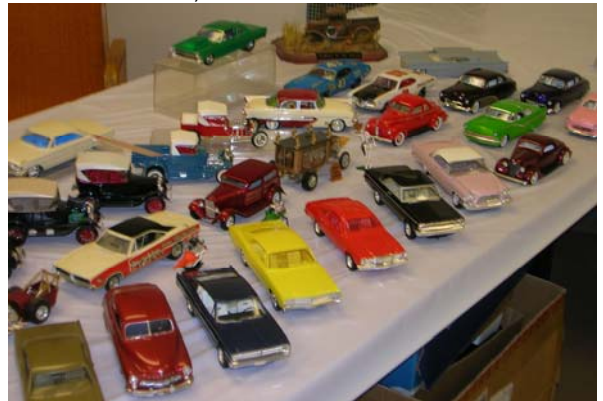
One of the Automotive display tables