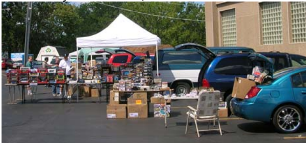
Outside Trunk Sale

The 2006 Plastic Summer Meltdown event, hosted by IPMS/CARS in Miniature and GTR , took place Sunday, August 20, at the same location as last year, the Algonquin Township Offices in Cary. There were indoor swap tables as well as the outside "trunk sale". The event was an NNL style exhibition, for all classes of models.