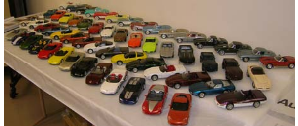
A collection of Corvettes: every year is represented!