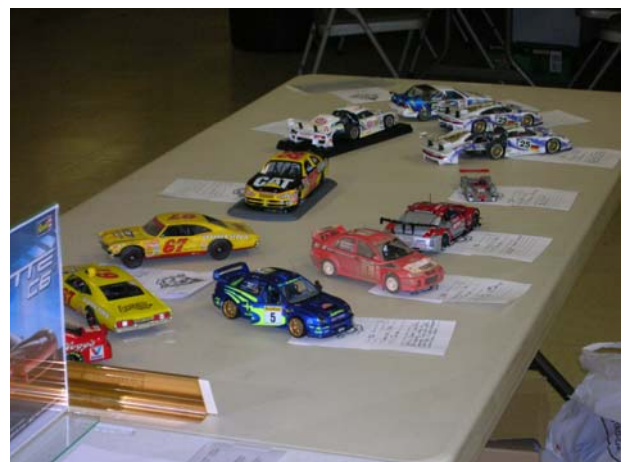
Closed Wheel Competition table