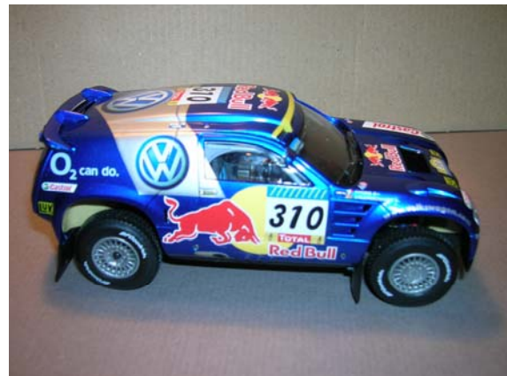
The finished model compared to...