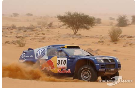
...the real car in action.