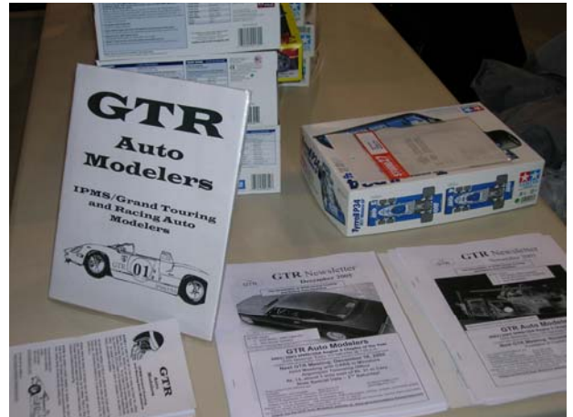
GTR had our usual table in the vendor room, and several members used it to sell off some surplus kits.