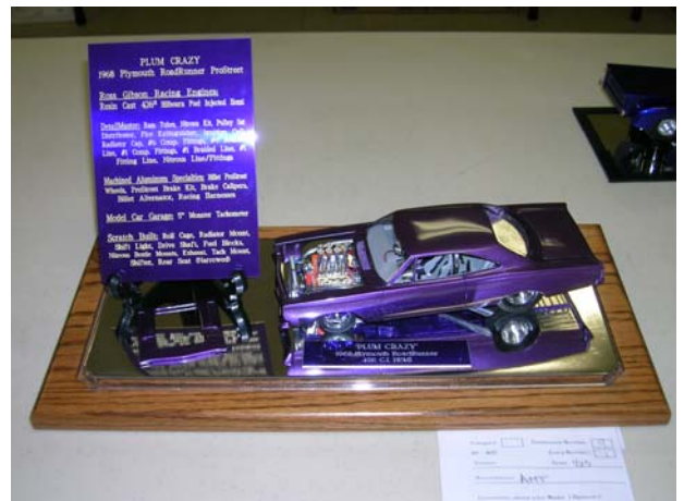
People's Choice Award Winner