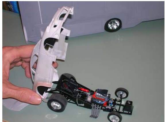
George Pritzen: a project to add a Mitsubishi Eclipse body on a funny car chassis with a big V-8.