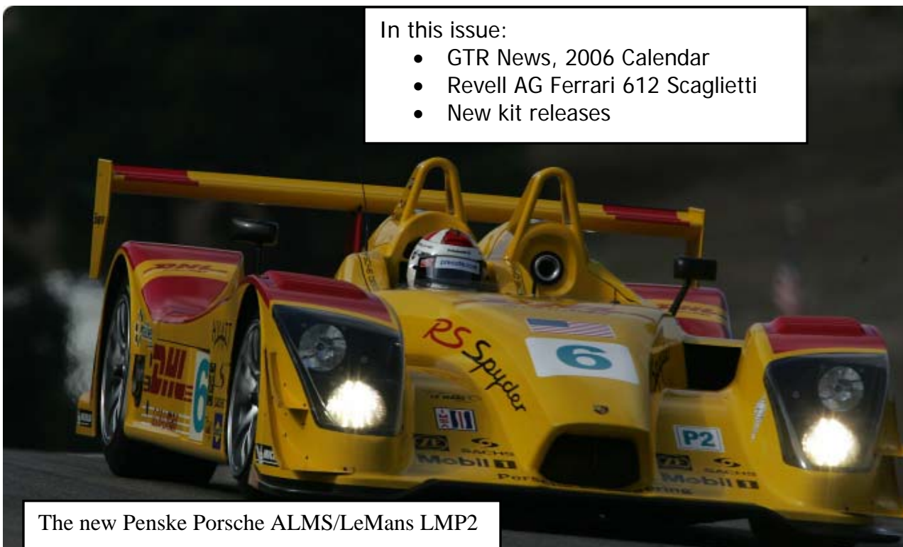
The new Penske Porsche ALMS/LeMans LMP2