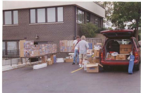
Vendors in the outdoor Trunk Sale