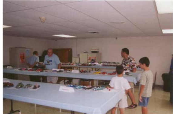
Display area starting to fill