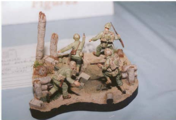
Best Military Subject