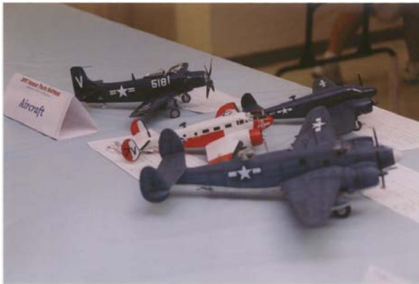
Best Aircraft: Lockheed PV-1 Ventura