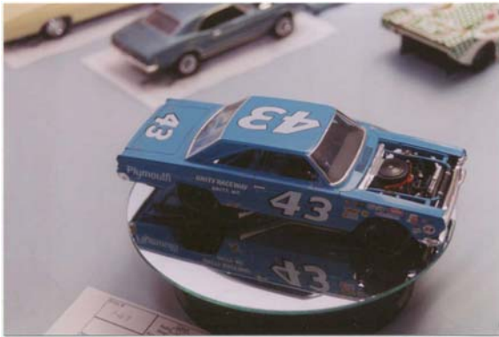
1967 Petty Plymouth NASCAR voted Best of Show Automotive