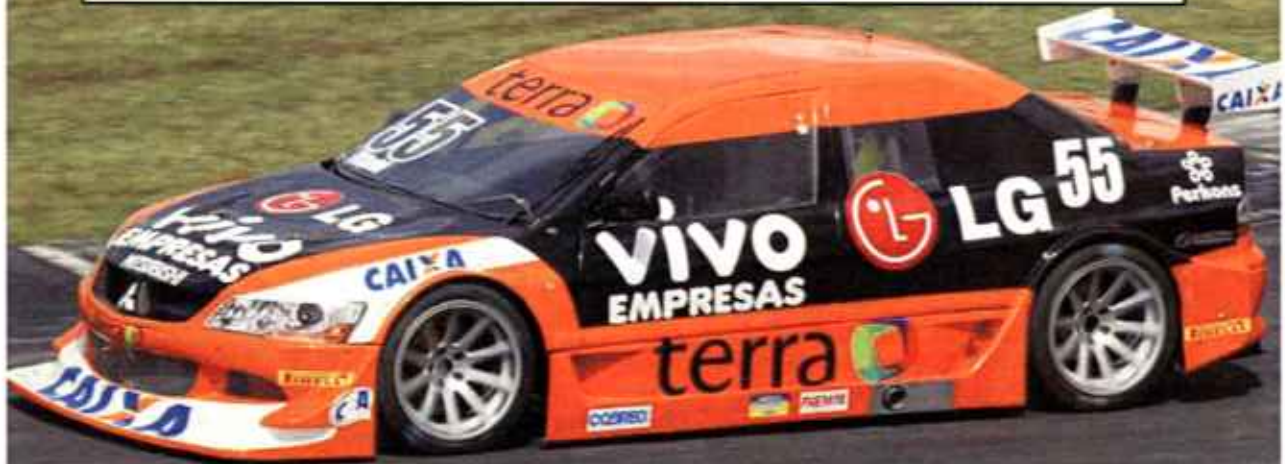
Christian Fittipaldi's Mitsubishi in the Brazilian V8 Stock Car Series