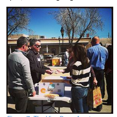
Figure 7: The Viva Dona Ana team distributes materials at a mobile workshop.

funding for the Viva Dona Ana Initiative. The mobile workshops focused on the Comprehensive and Corridor Plans and included distribution of printed materials and conversations with residents about the planning efforts. A complete summary of the feedback received can be found at <a href="https://www.vivadonaana.org/mobileworkshops.">www.vivadonaana.org/mobileworkshops.</a>. Many of the comments focused on jobs; the need for more transportation options, particularly in the rural areas; concerns about groundwater availability and water rights; and agriculture. Since the Viva Dona Ana project is still in the very early stages of development, it is yet to be determined how the comments received will be worked into the planning documents; however, this form of public outreach has proven to be effective in engaging residents.