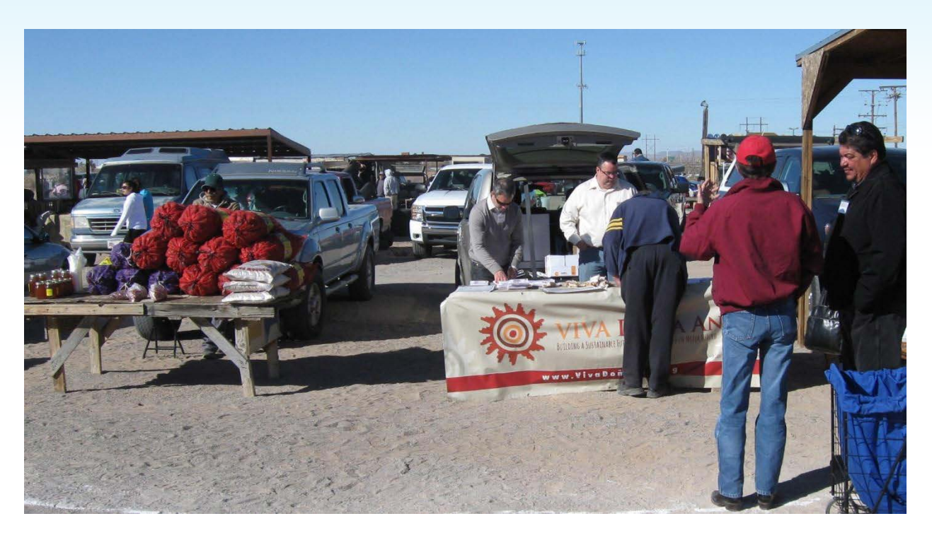
Figure 8: The Viva Dona Ana team set up mobile workshops at a variety of locations throughout the county, including an outdoor market.