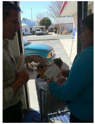
Figure 6: Residents voiced their opinions at mobile workshops.

An ongoing challenge in the transportation community is how to engage the public, obtain feedback, and incorporate responses into planning documents. Dona Ana County, located in southern New Mexico, has an innovative method for educating the public about livability principles and soliciting feedback from residents who are not typically involved in the planning process. Through a series of mobile workshops, the <u>Viva Dona Ana</u> team met with approximately 250 people to discuss issues such as jobs, housing, education, and transportation.