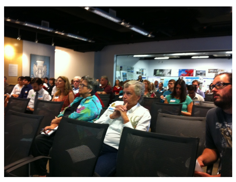
Figure 5: Participants at the Alamo Region Livability Summit.

The Alamo Region Livability Summit was the fourth workshop in an annual series sponsored by the Region 6 PSC. Over the past four years, the PSC and FHWA Texas Division held prior livability summits in Arlington (2010), Austin (2011), and Houston (2012) reaching over 500 participants. The events have drawn a wide range of participants, including civil engineering consultants, environmental specialists, university researchers, students, urban planners,