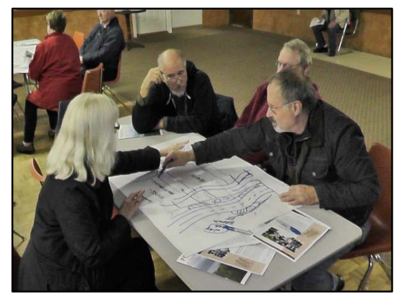
Figure 1: from Ocean Shores community workshop.

In the city of Ocean Shores, Forterra developed the first complete streets policy on the Olympic Peninsula, ensuring future roads and street improvements will be designed for users of all ages and abilities, whether walking, bicycling, using transit, or driving. In addition to better connecting its waterfront, tourist areas, and the main shopping district through complete streets, Ocean Shores was eager to pursue economic and community development through a more vibrant and accessible streetscape. To create an ordinance that