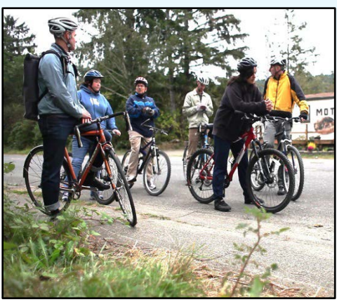
Figure 2: Photos by Skye Schell (Forterra) from Neah Bay biking and walking audits