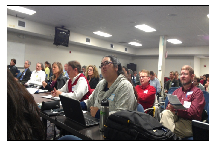
Figure 4: Participants at the FHWA Green Streets Workshop on April 24, 2013

Participants were provided real-world examples of green streets and infrastructure efforts within the Central Texas and San Antonio regions. Sessions covered the following topics: