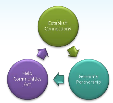
Figure 3: Schematic portraying the Idaho Division Office approach to fostering livability.

As a result of these conversations, the FHWA Idaho Division Office has focused on establishing connections, generating partnerships, and helping communities act, primarily through the use of two tools: social media and webinars. The Idaho Division Office created a Livable Idaho Facebook page to connect communities to each other and to disseminate information. The page contains updates on how the Idaho Division advances livability, relays information about funding and other resources, and highlights work that Idaho communities are doing to promote livability. The Livable Idaho webinar series features a different Idaho community each month. Representatives from the community present the work they have done to become a more livable community and the lessons learned about partnering, collaboration, leveraging resources, and funding. The webinars are intended to provide short, digestible lessons on what has worked for Idaho communities to achieve their livability goals.