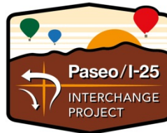
Paseo Del Norte/I-25 Interchange RECONSTRUCTION PROJECT