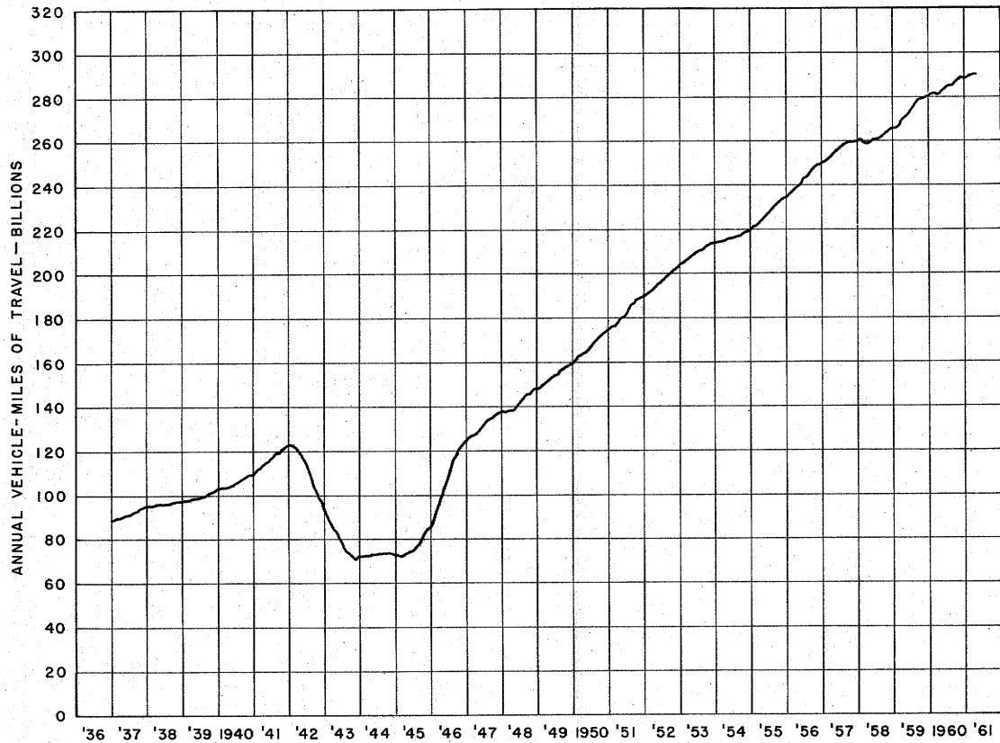
FIGURE 2--TRAVEL ON MAIN RURAL ROADS BY 12-MONTH PERIODS ENDING EACH MONTH, IN VEHICLE-MILES