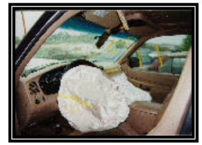
Figure 7. Deployed frontal air bag system.

The 1997 Ford Explorer was equipped with a frontal air bag system for the driver and right passenger positions. The system consisted of two crash sensors mounted to the upper radiator support panel, a safing sensor that was located in the front left kick panel, a control/diagnostic module located in the center instrument panel, a steering wheel mounted driver air bag module, and the front right passenger air bag module located in the right mid instrument panel. The system deployed ( Figure 7 ) as a result of the impact sequence with the rear of the Dodge Caravan.