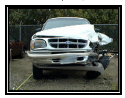
Figure 3. Frontal view of the Ford Explorer.

The damage extended rearward into the leading edge of the left front fender, the left front suspension, and the left front tire and wheel assembly. The crash forces transmitted into the left front suspension fractured the steering spindle. The components damaged by the impact included the front bumper, left headlamp assembly, grille, hood, radiator support, left front fender, and the left front suspension. The Collision Deformation Classification (CDC) for this impact was 12-FLEW-2.