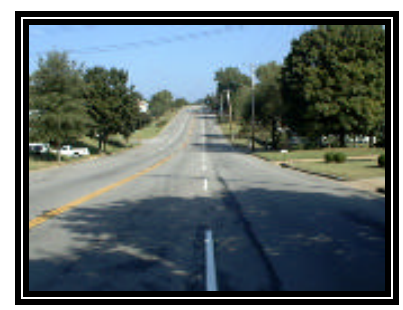
Figure 2. Northbound approach view of the crash scene.

The driver of the 1988 Dodge Caravan was traveling in a northerly direction on the inboard travel lane of the four-lane roadway ( Figure 2 ). She was decelerating for a left turn onto an intersecting street. The driver of the Caravan stated that there was no opposing traffic on her approach to the intersection. She further stated that she looked in her rearview mirror as she slowed for the left turn and did not detect the approaching Ford Explorer.