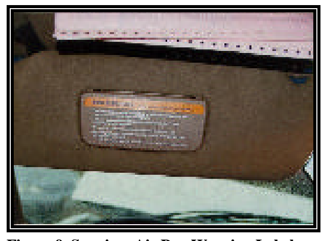
Figure 9. Sunvisor Air Bag Warning Label

*See Owner's Manual for further information and explanation.