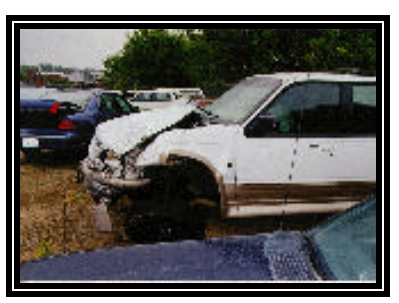
Figure 4. Profile view of the damage pattern to the Ford Explorer.