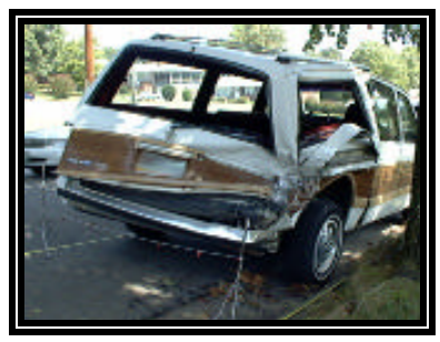
Figure 5. Right rear view of the Caravan's damage.