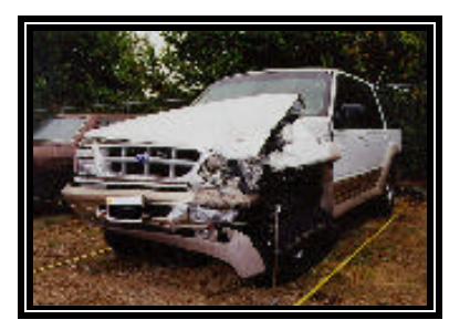
Figure 1. Front left view of the damage to the Ford Explorer.

This on-site investigation focused on the injury mechanisms and cause of death of a 5 year old male front right passenger of a 1997 Ford Explorer. The Explorer was equipped with frontal air bags for the driver and front right passenger positions that deployed as a result of an off-set, front-to-rear crash with a 1988 Dodge Caravan. The 31 year old female driver of the Ford Explorer was distracted to her right as she approached the slower moving Dodge Caravan. As she redirected her attention forward, the driver detected the Caravan and braked in an attempt to avoid the crash. The front left area of the Explorer ( Figure 1 ) impacted the back right area of the Caravan resulting in moderate damage to both vehicles. The unrestrained child passenger was displaced forward by the pre-crash braking into the