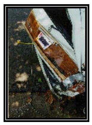
Figure 6. Overhead view of the Caravan's crush profile.