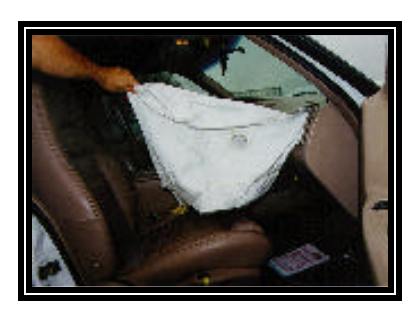
Figure 10. Excursion of the passenger air bag and adjusted position of the seat.

The front right child passenger of the Ford Explorer was in a presumed upright seated position with the seat adjusted to a mid track position. The seat back was adjusted to an angle of 19 degrees aft of vertical. The seat cushion sloped rearward at an angle of 19 degrees of horizontal. With the seat adjusted to this position, the horizontal distance between the seat back support and the vertical profile of the mid mount passenger air bag module cover ( Figure 10 ) was 74.9 cm (29.5"). The leather seat covering probably resulted in a reduced friction coefficient between the child's clothing and the cushion as compared to a fabric seat covering. The child was not restrained by the manual belt system.