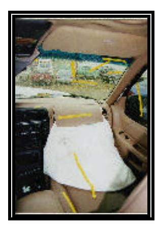
Figure 11. Child passenger trajectory and air bag contact points.

Ford Explorer direction. He proximity to result of the