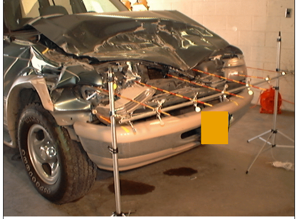
Figure 3: Case vehicle's underride (above bumper) damage pattern viewed from right of center with contour gauge present (case photo #17)

(23.4 feet). The southeast side of the northeastbound channel had a 0.4 meter (1.3 foot) paved shoulder prior to the adjacent 15.2 centimeter (6 inch) high barrier curb, and the northwest side had no shoulder but a 20.3 centimeter (8 inch) barrier curb prior to the unprotected, raised concrete gore. No pavement markings were present except for a delineated pedestrian crosswalk in the middle of the channelized turn lane. In addition, no edge lines were present. The estimated coefficient of friction was 1.20%. A regulatory YIELD sign (Manual on Uniform Traffic Control Devices, R1-2) was located prior to the merging area where the channelized lane joined the eastbound roadway. The speed limit approaching the channelized turn lane was 72 km.p.h. (45 m.p.h.). However, no regulatory speed limit sign was posted near the crash site. At the time of the crash the light condition was daylight, the atmospheric condition was cloudy, and the road pavement was dry. Traffic density was moderate, and the site of the crash was urban and primarily undeveloped.