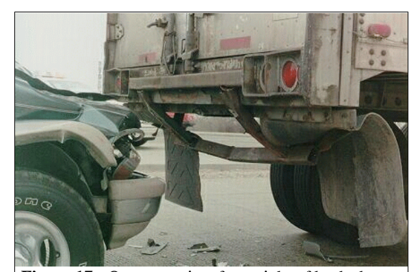
Figure 17: On-scene view from right of back showing Great Dane trailer's deformed underride guard and underride damage to case vehicle's front (case photo #51)

The 1990 International COF-9700 was a dual rear wheel drive, 6 x 4, Cab Over Engine (COE), Set Back Axle (SBA) two-passenger (with sleeper cab), two-door, truck-tractor (VIN: 1HSRKGUR6LH-----) equipped with a 14.0L, Cummins diesel engine and a thirteen (standard)-speed manual transmission. Braking was achieved by a power-assisted, dual air brake system. The case vehicle's wheelbase and odometer reading are unknown because the truck-tractor was not inspected. The 1981 Great Dane trailer (VIN: 1GRAE9020BS-----) was a stainless steel, straight frame, van-dry freight, 13.7 meter (45 foot), two-axle semi-trailer.