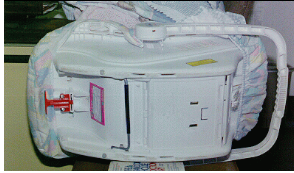
Figure 12: Backside of case vehicle's infant child safety seat showing no evidence of damage to seat during crash sequence (case photo #42)

Immediately prior to the crash the case vehicle's front right passenger [61 centimeters and 11 kilograms (24 inches, 24 pounds)] was laying reclined with her back against the back of the rear facing, Evenflo "Joyride," child safety seat (RFCSS). The child safety seat can be converted to an infant carrier. The child's head was pointed toward the right instrument panel and front right air bag module. The child's feet were oriented toward the seat back. The exact position of the child's hands are unknown. This contractor