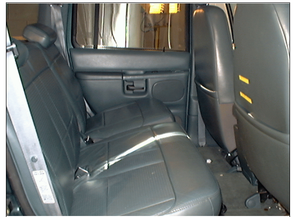
Figure 7: Case vehicle's back seating area showing scuff to front right seat back from unrestrained back right passenger (case photo #28b)

addition, the back surface of the rear view mirror was contacted by the child safety seat and the seat's blanket as a result of the seat being lifted upwards by the deploying front right passenger air bag ( Figure 8 ). The right side of the rearview mirror was rotated into the windshield, cracking the glazing. Finally, the upper portion of the steering wheel rim was bent toward the left instrument panel, 1.5 centimeters (0.6 inches), as a result of the driver loading the air bag, momentarily blocking the air bag's forward expansion, and causing the air bag to expand against and bend the steering wheel rim. This contractor was not allowed to pull apart the knee bolster; as a result the energy absorbing shear capsules could not be assessed.