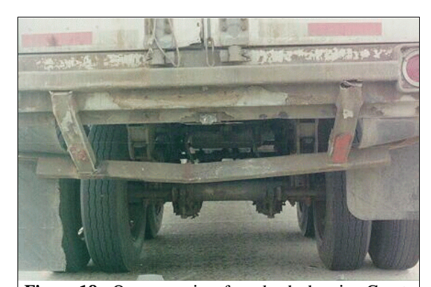
Figure 18: On-scene view from back showing Great Dane's deformed underride guard; Note: broken welds on underride guard (case photo #53)

Based on the available photographs ( Figures 17 and 18 ), the direct damage to the trailer involved the back underride guard which was pushed underneath the bed of the trailer. The TDC for tractor-trailer was determined to be: 06-BDLW-A (180) -maximum crush is unknown. No reconstruction program was used on this crash because this tractor-trailer combination is out-of-scope. The International truck-tractor was driven from the scene.