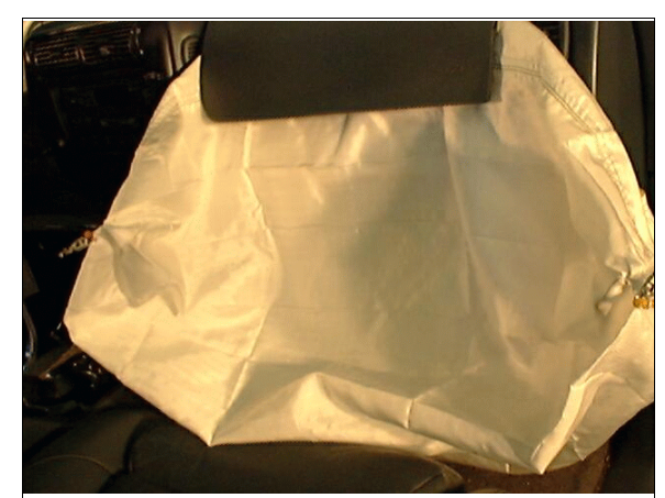
Figure 10: Top surface of case vehicle's deployed front right passenger air bag showing no obvious evidence of damage or contact (case photo #30)

The deployed front right air bag was rectangular with a height of approximately 48 centimeters (18.9 inches) and a width of approximately 93 centimeters (36.6 inches). An inspection of the front right air bag revealed no contact evidence readily apparent on the air bag's fabric ( Figures 10 and 11 ).