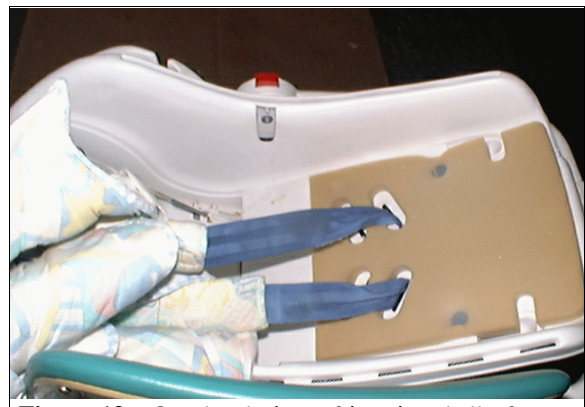
Figure 13: Overhead view of interior shell of case vehicle's infant child safety seat showing no evidence of damage to seat during crash; Note: seat cover removed (case photo #44)

believes that the pre-crash position of the child safety seat in the case vehicle was at an approximate 25 degree angle (i.e., it should have been positioned at a 45 degree angle). Just prior to the crash, the rear facing child safety seat was most likely positioned close to the front right seat back. However, the evidence on the front right air bag module's cover flap indicates that at least