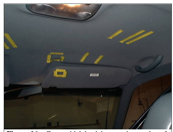
Figure 16: Case vehicle's right sun visor and roof contacts from child safety seat and seat's infant (case photo #26)

The front right occupant was transported by ambulance to the hospital. She sustained critical head injuries and was hospitalized prior to being