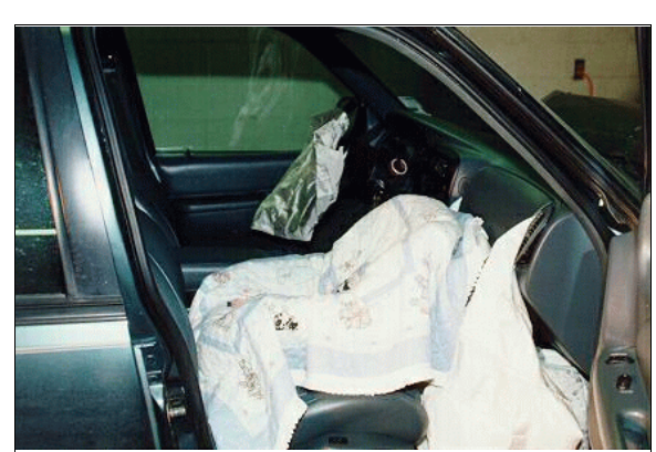
Figure 14: Case vehicle's front seating area showing deployed air bags and child safety seat's location in front right seat (case photo #37)

on one, if not more, occasions, the child seat had been positioned in this vehicle such that the seat handle was leaning against the front right passenger air bag module's cover flap. This could have occurred because of the way the child seat was placed in the front right position or because the front right seat track was closer to the instrument panel and air bag module. The case vehicle's driver does not recall the exact placement of the child safety seat prior to the crash. When the back of the child seat was located so as to be leaning against the front right air bag module's cover flap, the foot portion of the RFCSS, where the infant's feet would have