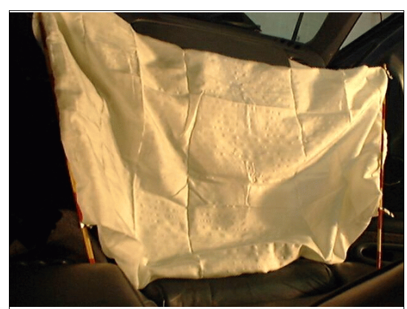
Figure 11: Front surface of case vehicle's deployed front right passenger air bag showing no obvious evidence of damage or contact (case photo #29)