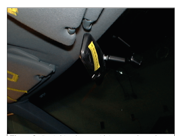
Figure 8: Backside of case vehicle's rearview mirror which was contacted by child safety seat after being lifted upwards by deploying front right passenger's air bag; Note: driver's side of mirror cracked windshield's glazing (case photo #22)

Based on the vehicle inspection, the CDC for the case vehicle was determined to be: 12-