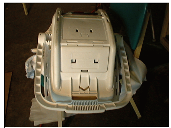
Figure 15: Undamaged back and carrying handle of case vehicle's rear facing child safety seat which was toward front right air bag module's cover flap (case photo #43)

The case vehicle's front right infant passenger was unrestrained in a rear facing child safety seat which was also not secured by the available, active, three-point, lap-and-shoulder, safety belt system. Furthermore, there was no evidence of belt pattern bruising or abrasions to the child's body. In addition, the inspection of the front right passenger's seat belt webbing, metal "D"-ring, and latch plate showed no evidence of loading or usage during the crash. An inspection of the Evenflo "Joyride" child safety seat showed no signs of damage from interacting with the front right air bag module's cover flap (Figure 15). This strongly supports the notion that at the time of the air bag's deployment, the cover flap missed the child safety seat.