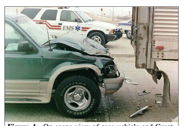
Figure 4: On-scene view of case vehicle and Great Dane's trailer at final rest; Note: trailer's underride guard damaged and bent underneath trailer (case photo #04)

The front of the case vehicle ( Figure 3 ) impacted the underride guard on the back of the Great Dane's trailer ( Figure 4 ), bending it forward and causing the case vehicle's driver and front right passenger supplemental restraints (air bags) to deploy. The case vehicle and the tractor-trailer came to rest essentially at impact.