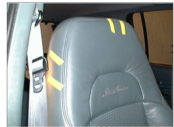
Figure 6: Unknown body fluids on case vehicle's front right seat back most likely from front right infant passenger (case photo #28a)

Inspection of the case vehicle's interior revealed that there was a scuff (i.e., possibly skin or makeup) along the roof over the driver's seating area and on the driver's sun visor ( Figure 5 above). Scuffs (i.e., possibly skin) were also present along the roof over the front right passenger's seating area and on the front right sun visor ( Figure 5 above). Furthermore, there was an unknown liquid (e.g., saliva from the baby) present on the front surface of the front right seat's back support ( Figure 6 ) and there was a scuff on the back surface of the front right seat's back support from contact by the back right passenger ( Figure 7 ). There were blood smears to the driver's seat cushion and door sill. In