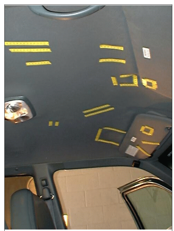
Figure 5: Vertical view from right of contact evidence on case vehicle's sun visors and roof (case photo #23)

and exhibited a distinct heavy truck underride type pattern (Figure 3 above). Direct damage extended from bumper corner to bumper corner, a measured distance of 151 centimeters (59.5 inches), across the entire width of the hood. Direct damage to the hood extended rearward 81 centimeters (31.9 inches). Maximum (i.e., residual) crush on the hood was measured as 62 centimeters (24.4 inches) at C_6 . residual crush to the case vehicle's grille area was measured as 23 centimeters (9.1 inches) between C_3 and C_4 . Direct damage to the bumper involved the top surface only (i.e., scratches). Direct damage began at the front right bumper corner and extended, 97 centimeters (38.2 inches), along the bumper to the left. There was no measurable crush to the front bumper. Neither the wheelbase on the case vehicle's left nor right sides was The case vehicle's front bumper shortened. fascia, grille, hood, radiator, right headlight and turn signal assemblies, and right fender were directly damaged and crushed rearward. None of the case vehicle's tires were physically restricted or deflated.