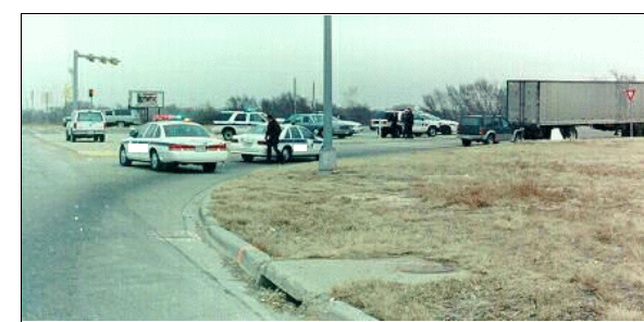
Figure 1: On-scene north-northeast view of channelized right-hand turn lane showing case vehicle and tractor-trailer at final rest (case photo #01)

The case vehicle had just exited an interstate highway, traveling northward in the outside northbound lane of a three-lane, one-way, frontage road. The case vehicle had entered a channelized, right-hand, turn lane ( Figure 1 ) intending to traveling east on a six-lane, divided, U.S. trafficway. The other vehicle which had also exited the interstate highway and entered the