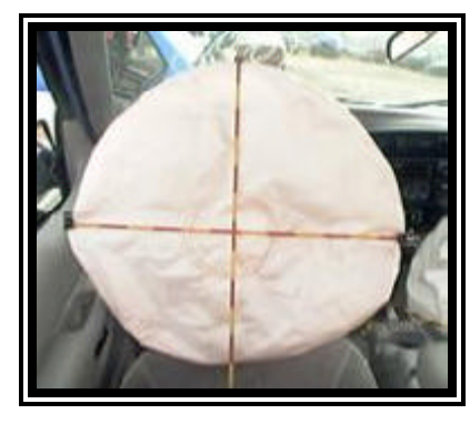
Figure 4. 1998 Ford Explorer XL redesigned driver air bag.

The front right passenger air bag deployed from the right mid-instrument panel area with a single cover flap design hinged at the top aspect. No contact evidence was identified on the air bag or exterior surface of the module cover flap. The cover flap was rectangular in shape and measured 37.0 cm (14.6 in) in width and 17.0 cm (6.7 in) in height. The NASS researcher measured the passenger air bag at 66.0 cm (26.0 in) in width and 50.0 cm (19.7 in) in height in its deflated state ( Figure 5 ). No internal tether straps were present. The bag was vented by two ports located at the 9 o'clock and 3 o'clock sectors on the side aspect of the air bag. No cutoff switch was found for the front right air bag.