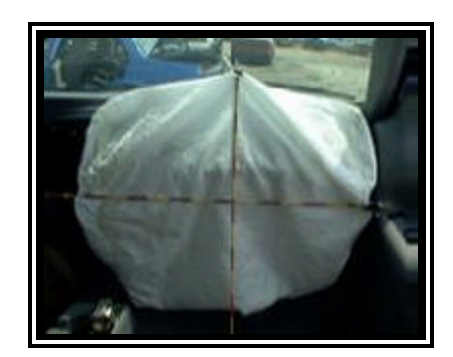
Figure 5. 1998 Ford Explorer redesigned passenger air bag.