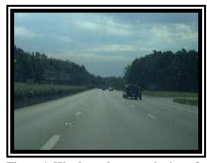
Figure 1. Westbound approach view of the crash site.

The 18 year old male driver of the 1989 Lincoln Mark VII was operating the vehicle westbound on the inboard lane at a (driver reported ) speed of 89 km/h (55 mph) when he failed to observe the westbound Ford as he changed lanes to the right. He reported to police that the Ford "was in his blind spot". The 16 year old female driver of the 1998 Ford Explorer was operating the vehicle westbound in the center lane ( Figure 1 ) at a (surrogate reported) speed of 89 km/h (55 mph) when she observed the westbound Lincoln enter her lane of travel. Upon recognition of the impending harmful event, the Ford driver