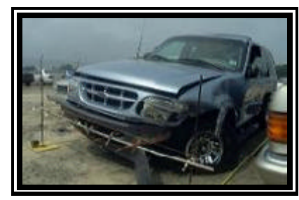
Figure 2. Frontal and left side surface damage to the 1998 Ford Explorer XL.

The 1998 Ford Explorer XL sustained minor left side surface damage as a result of the initial impact with the Lincoln ( Figure 2 ). The direct contact damage began 90.0 cm (35.4 in) aft of the left rear axle and extended 309.0 cm (121.7 in) forward. Six crush measurements were documented at the level of the middoor: C1= 2.0 cm (1.6 in), C2= 1.0 cm (4.7 in), C3= 4.0 cm (7.1 in), C4= 8.0 cm (8.7 in), C5= 3.0 cm (9.4 in), C6= 0 cm. The ( SCI revised ) Collision Deformation Classification (CDC) for