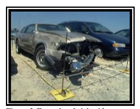
Figure 3. Frontal and right side surface damage to the 1989 Lincoln Mark VII.

this initial impact to the Ford was 09-LDEW-1 with a principal direction of force of (-)90 degrees. Direct contact damage was also identified at the front left area attributed to the secondary (concrete barrier) impact. The direct contact damage began at the front left bumper corner and extended 45.0 cm (17.7 in) inboard. The impact deformed the full frontal width resulting in a combined direct and induced damage length (Field L) of 128.0 cm (50.4 in). Six crush measurements were documented at the level of the bumper: C1= 28.0 cm (11.0 in), C2= 6.0 cm (2.4 in), C3= 3.0 cm (1.2 in), C4= 1.0 cm (0.4 in), C5= 0 cm, C6= 0 cm. The Collision Deformation Classification (CDC) for this second and final impact to the Ford was 12-FLEW-2 with a principal direction of force of (-)10 degrees. The left headlight assembly fractured and partially separated from the vehicle during the collision sequence. The left fender was displaced rearward and to the right which restricted/deflated the left front wheel/tire and jammed the left door. All glazing remained intact.