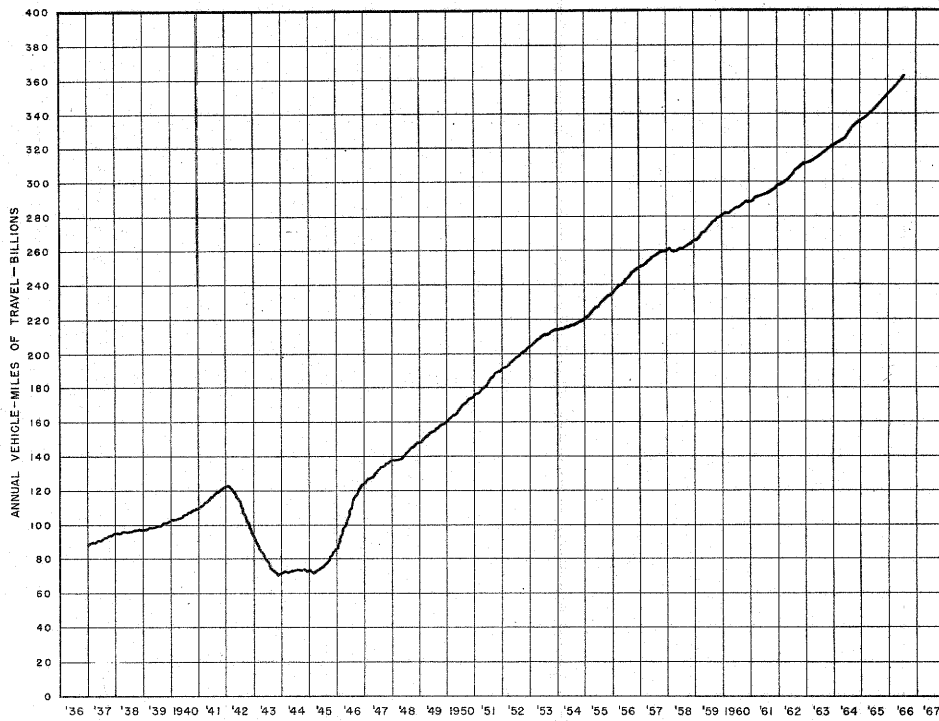
FIGURE 2--TRAVEL ON MAIN RURAL ROADS BY 12-MONTH PERIODS ENDING EACH MONTH, IN VEHICLE-MILES