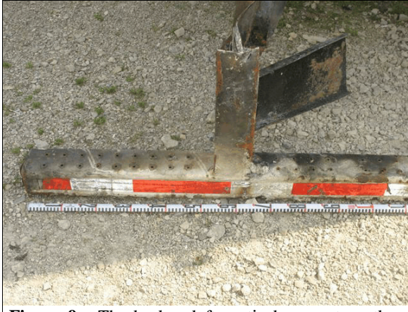
Figure 9: The broken left vertical support on the impact guard