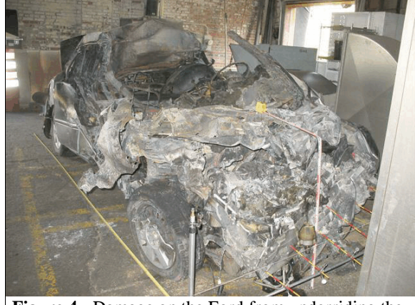
Figure 4: Damage on the Ford from underriding the semi-trailer and from the fire