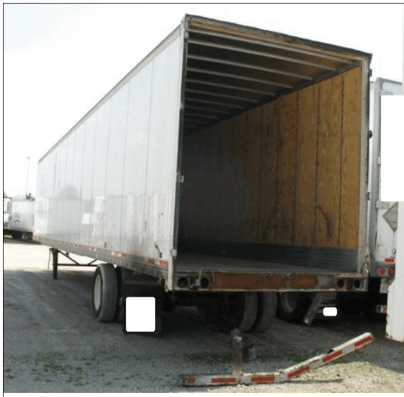
Figure 1: The damaged 2008 Wabash National semitrailer and its damaged rear impact guard

This on-site investigation focused on a 2008 Wabash National semi-trailer and its rear impact guard (Figure 1). This crash was brought to our attention by the National Highway Traffic Safety Administration (NHTSA) on March 23, 2009. The investigation was assigned on April 20, 2009. The crash involved a 2005 Ford Taurus SE and the Wabash semi-trailer, which was pulled by a 2002 Freightliner CST120 6x4 truck-tractor. The crash occurred in March, 2010, at 1418 hours, in Ohio and was investigated by the Ohio State Highway Patrol. The inspection of the Wabash semi-trailer, Ford, and the crash scene were conducted on April 21-22, 2010. This report is based on the police crash report, crash scene and vehicle inspections, and evaluation of the evidence.