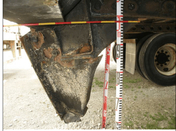
Figure 8: Right side view of the right vertical support for the impact guard on the semi-trailer