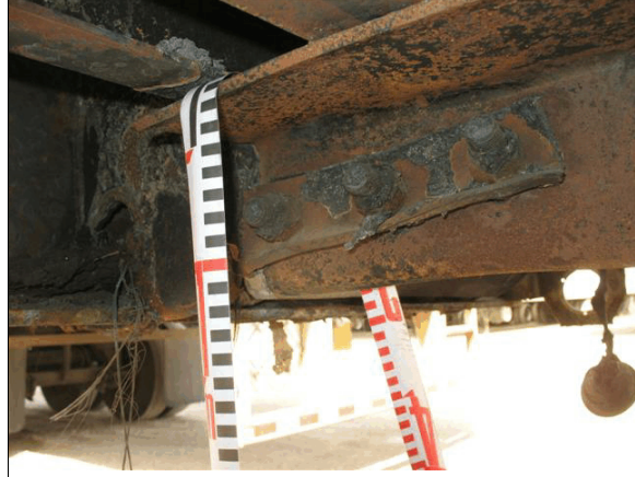
Figure 10: The broken impact guard vertical support bracket on the left frame rail of the semi-trailer