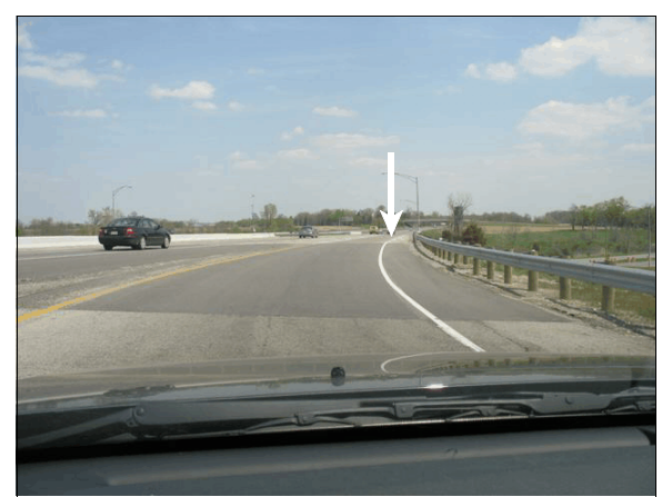
Figure 3: Approach of the Ford entering the entrance ramp lane; arrow shows area of impact

Crash: The front plane of the Ford (Figure 4) impacted the impact guard (event 1) and underrode the back of the semi-trailer (Figure 5). A fire ignited in the Ford's engine compartment (event 2). The impact guard engagement on the Ford began at the front left bumper corner. The direct contact on the impact guard began at the left corner and extended approximately 160 cm (62.9 in) to the right. The crash separated the impact guard from the semi-trailer. The Ford penetrated under the semi-trailer and contacted the mud flap bracket, air reservoir tank, slack adjusters, and back axle (Figure 6). The tandem wheels on the semi-trailer were adjusted forward. The distances from the back of the semi-trailer to the back tires and back axle were 222 cm (87 in) and 271 cm (106.7 in), respectively. The A-pillars and roof of the Ford engaged the back of the semi-trailer, and the roof was crushed rearward 77 cm (30.3 in). Both vehicles came to final rest in the entrance ramp merge lane heading east.