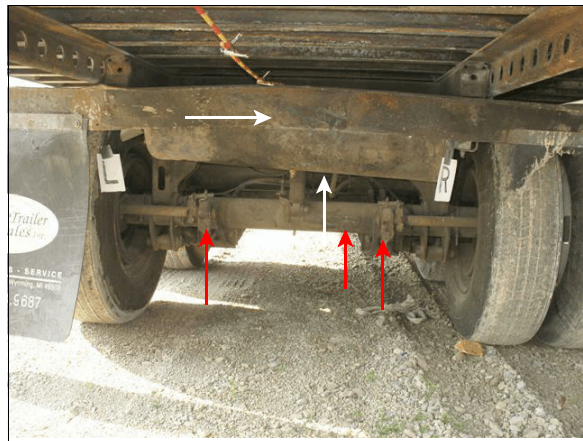
Figure 6: The Ford contacted the mud flap bracket, air reservoir tank, slack adjusters, and the axle

Post-Crash: The police were notified of the crash at 1422 hours and arrived at the crash scene at 1429 hours. The driver of the Freightliner attempted to put out the fire with an extinguisher from his vehicle but was unsuccessful. The fire was subsequently extinguished by a local fire