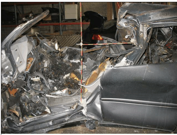
Figure 11: Left side view of the roof and A-pillar crush on the Ford

Damage Classification: The CDC for the front impact with the semi-trailer was 12FDAA9 (0 degrees). A Delta V could not be calculated for the Ford since an impact with a heavy truck is out of scope for the WinSMASH program. However, WinSMASH was used to calculate a Barrier Equivalent Speed (BES) based on the front crush on the Ford. The calculated BES was 51.2 km/h (31.8 mph).