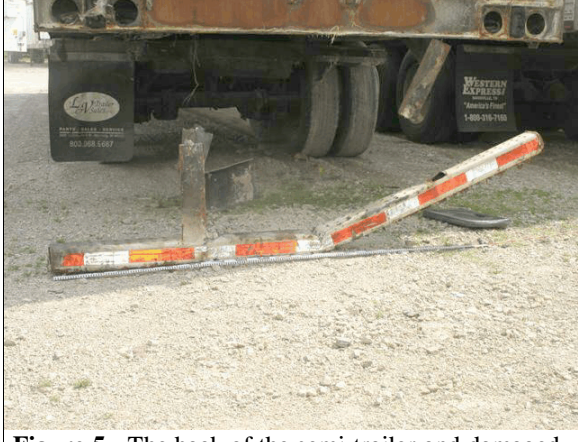
Figure 5: The back of the semi-trailer and damaged impact guard