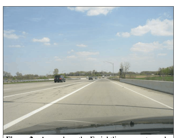
Figure 2: Area where the Freightliner was stopped

Pre-Crash: The driver of the Freightliner was traveling east in the first lane from the right approaching the interchange area when a bird impacted the front of the vehicle. The driver pulled the vehicle to the right into the entrance ramp merge lane and stopped ( Figure 2 ). He activated the vehicle's emergency flashers and exited the vehicle to check for damage. The Ford's driver was traveling east in the entrance ramp merge lane negotiating a right curve and approaching the back of the semi-trailer ( Figure 3 ). Witnesses estimated the travel speed of the