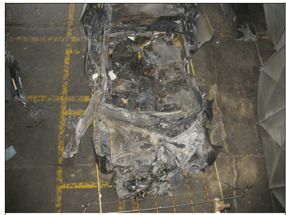
Figure 12: Top view of the crush on the Ford