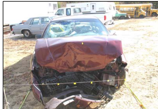
Figure 4 - Damaged 1998 Chevrolet Lumina.

The 1998 Chevrolet Lumina sustained moderate damage as a result of the impact with the Toyota 4-Runner and the light standard ( Figure 4 ). One crush profile was generated for the two events due to overlapping damage. An analysis of the damage pattern reveals that the majority of the crush was caused by the impact with the Toyota due in part to the uniformity of the damage across the full width of the hood. Isolating this damage, the SCI inspection revealed that the direct contact damage and induced damage encompassed the width of the bumper beam and measured 109 cm (43") in width. The maximum crush was located 4 cm (1.6") right of the vehicle's centerline and measured 64 cm (25") in depth. The crush profile consisted of six equidistant crush measurements taken along the bumper beam and was as follows: C1 = 10 cm (3.9"), C2 = 42 cm (16.5"), C3 = 59 cm (23.2"), C4 = 64 cm (25"), C5 = 36 cm (14.2"), C6 = 11 cm (4.3"). The estimated Collision Deformation Classification (CDC) for the impact with the Toyota was 12-FDEW-2.