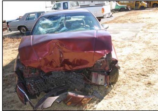
Figure 1 - Subject Vehicle - 1998 Chevrolet Lumina

This on-site investigation focused on the performance of a Graco CarGo booster Child Safety Seat (CSS) that was present in a 1998 Chevrolet Lumina four-door sedan ( Figure 1 ). The vehicle was occupied by a restrained 20-year old female driver and a 4-year old female seated in the booster CSS in the right rear seating position. The child was restrained within the CSS by the vehicle's manual lap and shoulder restraint. The Chevrolet was equipped with redesigned frontal air bags for the driver and front right passenger position, which