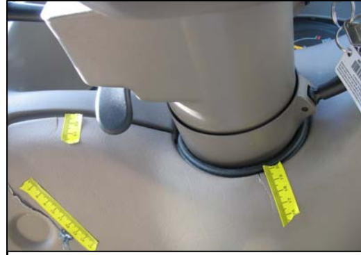
Figure 5 - Damaged knee bolster.

The 1998 Chevrolet Lumina sustained minor interior damage as a result of occupant contact. The contact was confined to the front left knee bolster and was in the form of three fractures to the rigid plastic knee bolster covering ( Figure 5 ). The first fracture was located 14 cm (5.5") inboard of the left aspect of the instrument panel and 3 cm (1") below the top of the knee bolster. The vertical fracture was 8 cm (3") in length top to bottom. The fracture had associative blue jean fabric transfers embedded into the crack that resulted from the loading of the driver's left knee. The second fracture was located 20 cm (8") inboard of the left aspect of the instrument panel and was vertically located on the mid-seam separating the instrument panel from the knee bolster covering. The second fracture was 1 cm (0.5") in length and probably resulted from the deformation of the plastic panel during the knee contacts. The third fracture was located 38 cm (15") inboard of the left aspect of the knee bolster and directly underneath the base of the steering column. This vertical fracture was 3 cm (1.25") in length and probably resulted from the loading of the driver's right knee. The underlying energy absorption material was deformed as a result of the first and third panel fractures.