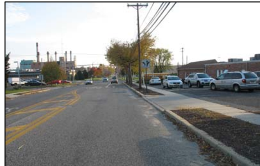
Figure 2 – Southbound approach of Chevrolet.

Both impacts involved the frontal plane which resulted in a combined crush profile. The combined crush profiles of the two impacts were used to generate a barrier algorithm of the WinSMASH program. The program computed a total delta-V of 43 km/h (26.7 mph). The specific longitudinal and lateral velocity