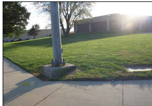
Figure 3 - Impacted light standard.