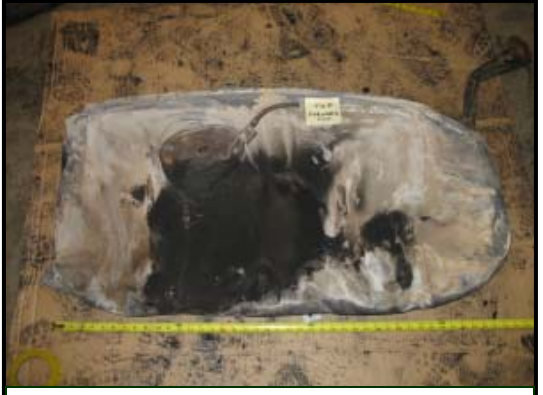
Figure 16. Forward aspect of the fuel tank.

Figures 16 and 17 are views of the forward and rear sides of the tank, respectively. There were no punctures of these major exposed sides. A small 2 cm x 2 cm (0.8" x 0.8") hole was located on the top surface of the deformed tank. It was located 15 cm (5.8") inboard of the left tank strap. This hole was not the result of a direct puncture, but occurred as the result of a crease and subsequent tear of the steel as the tank was