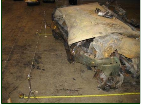
Figure 12. Left lateral view documenting the extent of crash.

The left wheelbase was reduced in length by 37 cm (14.4") while the right wheelbase was elongated by 6 mm (0.25"). The frontal impacted displaced the left A-pillar rearward which resulted in minimal buckling of the roof aft of the pillar. Both left side doors were jammed closed. The front right door was open at final rest, a possible indicator that the driver attempted to exit the vehicle. The right rear door remained closed. Rescue personnel removed the right front door to extricate the body of the driver. All glass was