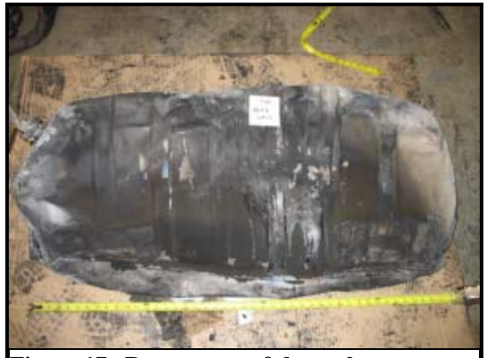
Figure 17. Rear aspect of the tank.