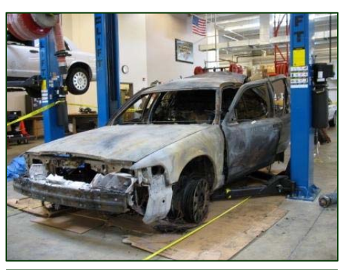
Figure 8. Front left view of the CVPI and associated fire and rescue damage.

Fire department personnel used hydraulic equipment to cut the left B-pillar from the vehicle. The pillar was cut from the level of the beltline to the roof side rail. The left front door was pried open to extricate the body of the driver. Figure 8 is a frontal view of the CVPI documenting the extent of damage due to fire and extrication efforts.