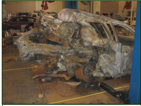
Figure 6. Right side view of the extent of crush and deformation.

The C-pillars were displaced forward by the impact resulting in deformation across the full width of the backlight header. The corners of the header were projected to the established reference line which resulted in a "Field L" measurement of 115 cm (45.25"). The residual crush profile at this level was as follows: C1 = 29 cm (11.5"), C2 = 39 cm (15.25"), C3 = 42 cm (16.5"), C4 = 43 cm (16.75"), C5 = 42 cm (16.5"), C6 = 43 cm (16.75"). The crush profiles are shown in Figure 7 . The Collision Deformation Classification (CDC) for this crash was 06-BZEW-7.