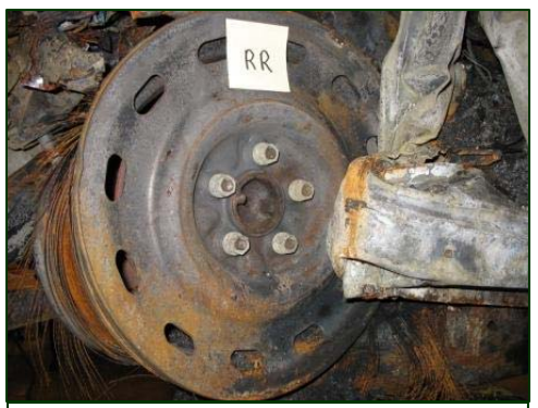
Figure 10. Right rear wheel of the CVPI.

The OEM steel wheels of the CVPI were a new design for 2005. The deep dish style steel wheel was identified as a 12 window wheel, with 12 rectangular slots around the outboard circumference. All four wheels were equipped with OEM hubcaps that melted during the fire. The inboard and outboard bead areas of the right rear tire were deformed from the extreme crush located at the back right corner of the vehicle. The remaining wheels were not damaged with tire cord fragments remaining on the wheels. The Goodyear Eagle tires were completely burned by