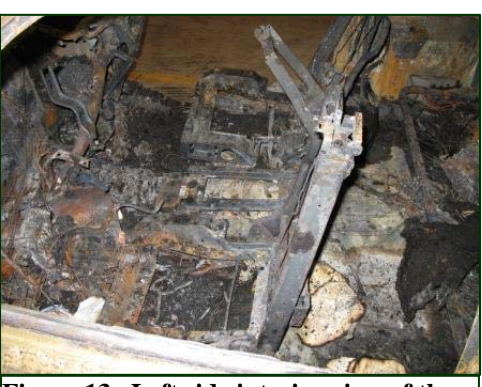
Figure 13. Left side interior view of the Silverado.

The police performed an inspection of the interior of the Silverado and removed debris in search of the vehicle's Event Data Recorder. The driver's