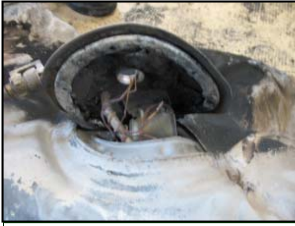
Figure 18. Displaced sending unit from forward aspect of tank.

Figure 19 is a view of the ruptured left side of the tank. The ruptured area deformed into a triangular pattern. The rupture measured 32x14 cm (12.5x5.5"), length by height. It should be noted that the rupture occurred in the parent metal outboard of the welded seam. The welded seam remained intact along its entire length. The fuel filler neck was not damaged during the deformation and was intact.