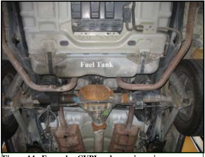
Figure 14: Exemplar CVPI undercarriage view.

Both the exemplar CVPI and the subject CVPI were equipped with the factory installed shield kits. The kit included two molded fiberglass reinforced plastic shields that covered the sway bar brackets on the respective sides of the vehicle, a molded rubber guard that covered the lower rear aspect of the differential cover and recessed the bolt heads and two rubber guards that protected the tank in the area of the lower tank straps. The purpose of the kit was to provide a layer of protection between the fuel tank and the rear axle/suspension components during a rear impact. Referring to the subject vehicle, the remnants of the burned fiberglass shields are visible and the rubber guards remained in place.