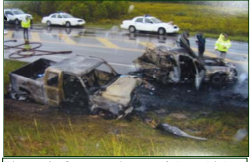
Figure 4. On-scene image of the vehicles at final rest.