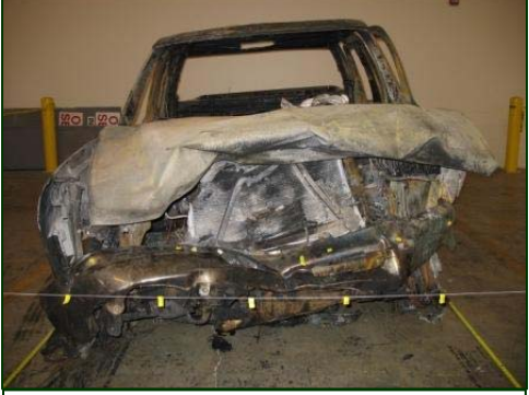
Figure 11. Frontal damage to the Chevrolet Silverado.

The Silverado sustained moderate severity frontal damage as a result of the crash with the CVPI. The direct contact damage on the hood face began approximately 44 cm (17.5") right of center and extended 130 cm (51") to the left corner ( Figure 11 ). The impact crushed the full frontal width of the vehicle resulting in a combined induced and direct contact damage length of 148 cm (58.5") along the deformed bumper. Maximum crush was 76 cm (29.75") located at the left corner of the bumper. The crush profile documented at bumper level ( Figure 12 ) was as follows: C1 = 76 cm (29.75"), C2 = 60 cm (23.75"), C3 = 60 cm (23.5"), C4 = 53 cm (21"), C5 = 29 cm (11.5"), C6 = 14 cm (5.5"). The CDC for this impact event was 12-FDEW-3.