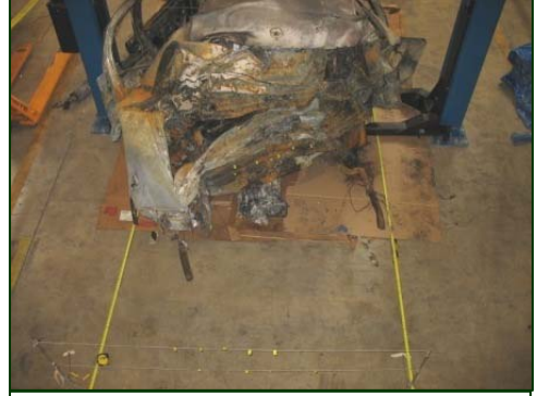
Figure 7. Overhead view of the crush depth.