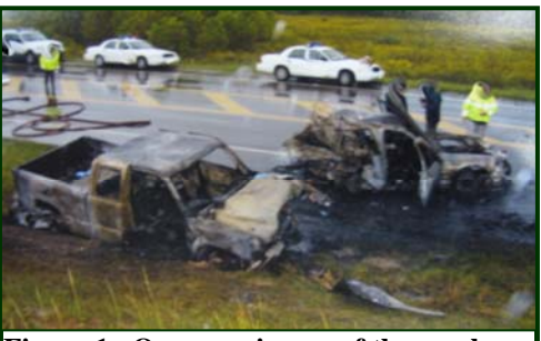
Figure 1. On-scene image of the crash site and the involved vehicles.

This on-site investigation focused on the severity of the crash, the source of the ensuing fire, and the cause of death of two on-duty police officer's who occupied a 2005 Ford Crown Victoria Police Interceptor (CVPI) and the female driver of the involved 2004 Chevrolet Silverado pickup truck. The CVPI was traveling in an easterly direction on a two-lane road during nighttime hours, reportedly (witness statements) with the overhead emergency lights and siren activated. The asphalt road surface was wet due to heavy rain. The