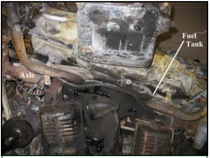
Figure 15: Deformed undercarriage of subject CVPI.