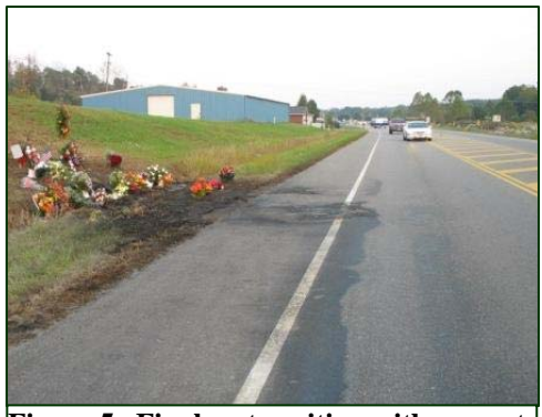
Figure 5. Final rest position with respect to the roadway.