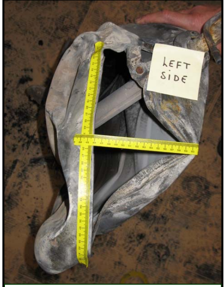
Figure 19. Ruptured left side of the fuel tank with filler tube in place.