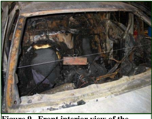
Figure 9. Front interior view of the CVPI.

The interior of the CVPI was severely damage by the crash and consumed by the ensuing fire ( Figure 9 ). The three rear seat positions of the vehicle were completely crushed by the forward displacement of the rear wall of the passenger compartment. This intrusion engaged the prisoner cage and displaced the cage forward into the front seat backs. The maximum forward displacement of the front right seat back was 37 cm (14.5"), while the front left seat back was displaced 10 cm (3.75") forward. The residual intrusion of the cage at the inboard aspect of the front right seat back was 21 cm (8.25").