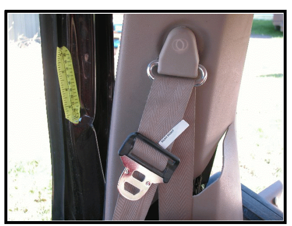
Figure 22. Possible contact to C pillar/side glass frame