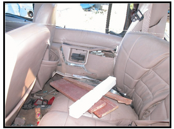
Figure 21. Right rear door

The 19-year-old female rear seat right occupant was seated on the leather covered bench seat with folding back. The seat back was slightly reclined by design. Prior to impact, the driver had steered the case vehicle sharply to left and the vehicle was in a counterclockwise rotation with the right side leading. At impact, the rear right occupant responded to the 80 degree direction of force by moving to the right and engaged the right rear door with her torso-causing the thoracic injuries. This occupant also sustained a spinal cord transection. She also likely contacted the C pillar/side glass frame area-possibly causing the facial contusion. According to the non-invasive death certificate, this occupant sustained a spinal cord transection. The location of the transection is not known. The injury mechanism for this injury is not known. The case vehicle was pushed into a sharp clockwise rotation by the striking vehicle. This occupant slid up the right side of the vehicle and responded to the centrifugal forces by sliding along the roof towards the backlight. The backlight glass had likely already disintegrated by the time she reached it. This occupant was ejected through the backlight during the spinning rotation and came to rest along the east roadway edge. She was fatally injured.