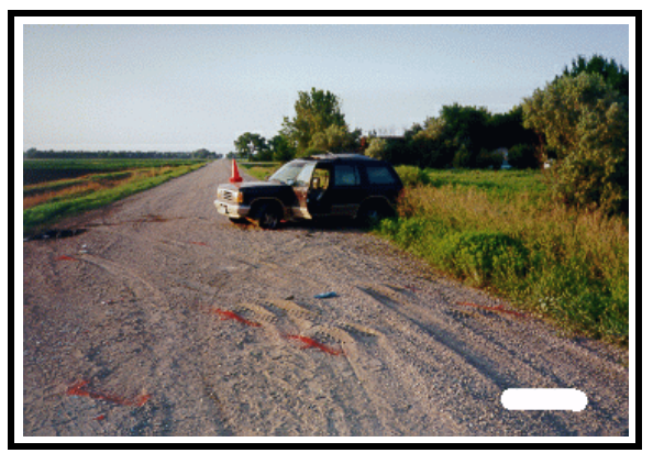
Figure 1. Final rest, case vehicle (looking north)

There were three additional occupants. The front right seat was occupied by a restrained 15-year-old female. The rear middle seat was occupied by a sixmonth-old male in a Cosco Arriva (model number 22-002-JAS) infant safety seat. The seat had not been anchored to the vehicle.