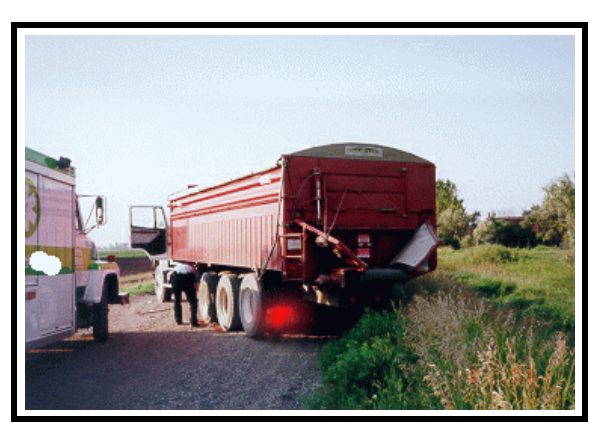
Figure 15. Left rear, other vehicle