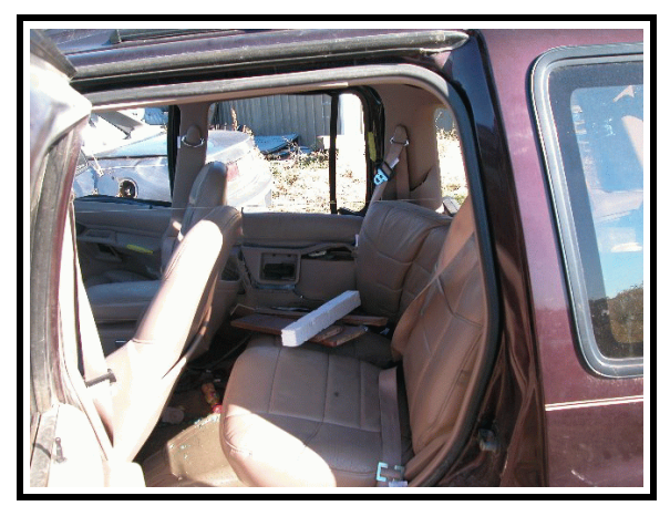
Figure 7. Rear seating area