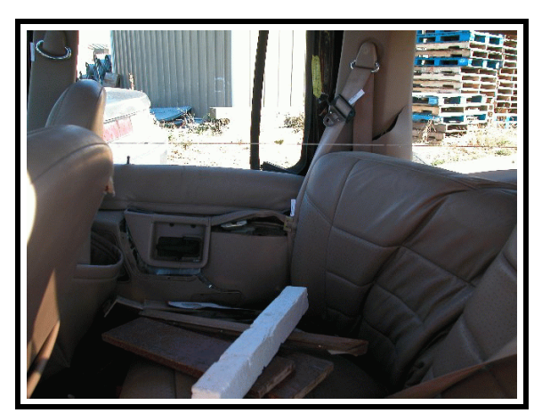
Figure 17. Right rear seat area/door contact