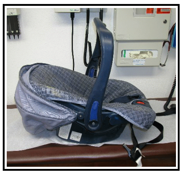
Figure 9. Cosco Arriva infant safety seat