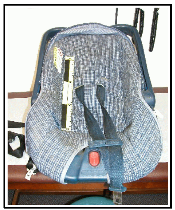
Figure 12. Cosco infant seat

The Cosco Arriva (model number 22-002-JAS) infant safety seat was manufactured on 11/06/02. The manufacturer recommends that it be used rear-facing only and would be appropriate only for those infants weighing less than 10 kg (22 lbs) and with a height less than 74 cm (29 in). It can be purchased with or without a base. In this case, a base was not being used. It was equipped with a 3-point harness. The harness had been routed through the lower set of slots and was in use at the time of the crash. The seat is designed to be secured to the vehicle by using either a lap belt or a lap and shoulder belt. In this case, the seat was not anchored to the case vehicle. The seat was also equipped with lower LATCH connectors which were not used during this crash.