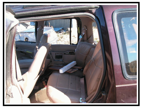
Figure 16. Overview of right rear seat area

The 15-year-old female front right occupant of the case vehicle was likely seated in a normal, upright fashion. The leather covered bucket seat was adjusted to the middle track position. The seat back was slightly reclined. She was wearing the available lap and shoulder belt. There was no upper anchorage adjustment for the shoulder belt. Prior to impact, the driver had steered the case vehicle sharply to left and the vehicle was in a counterclockwise rotation with the right side leading. At impact, she responded to the 80 degree direction of force by moving to the right before engaging the front right door panel with her right side. This contact resulted in several lumbar fractures, an abrasion to the right elbow and "blunt thoracoabdominal trauma". She was extricated from the vehicle by emergency personnel and transported by ground ambulance to a local hospital. She was admitted and was hospitalized for three days.