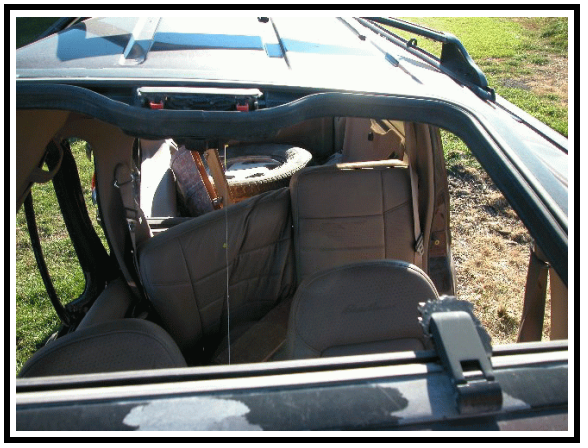
Figure 8. Overview of right side interior intrusion

The owner of the case vehicle has been charged with permitting a vehicle to be driven without insurance and permitting an unlicenced minor to drive.