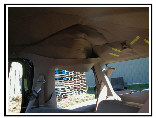
Figure 18. Ejection path towards backlight