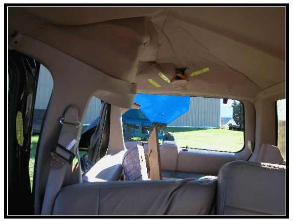
Figure 19. Overview of hatch area/likely ejection area

the right and likely engaged the right rear occupant to some extent. The case vehicle was pushed into a sharp clockwise rotation by the striking vehicle. The infant seat slid up the right side of the vehicle and responded to the centrifugal forces by sliding along the roof towards the backlight. The backlight glass had likely already disintegrated by the time the infant seat reached it. The infant seat was ejected through the backlight during the spinning rotation and came to rest along the east roadway edge. The child sustained a minor facial contusion on the left side of the upper lip, edema on the left lower side of the lower jaw, a clavicle contusion, forehead abrasions, and multiple minor puncture wounds. The puncture wounds would appear to be related to flying glass fragments. The clavicle contusions was likely related to interaction with the child seat harness. The sources of the remaining injuries are essentially unknown, given the impact and the post-impact ejection. The child was transported by ground ambulance to a local hospital and arrived at 1830 hours. He was hospitalized overnight as a precaution.