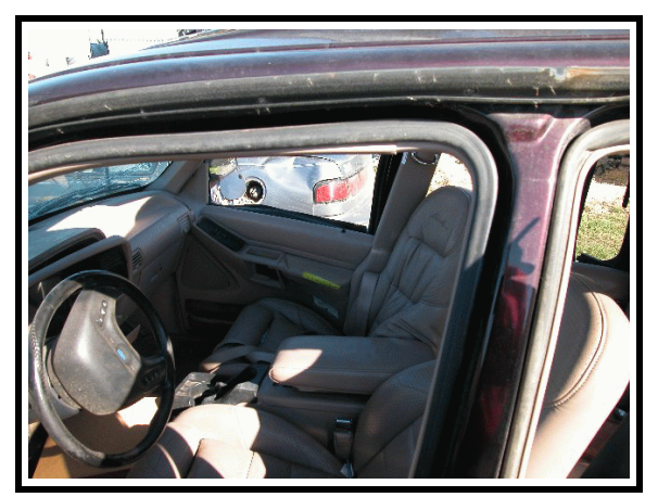
Figure 6. Front seating area