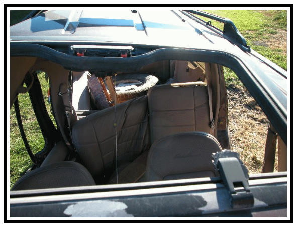
Figure 11. Interior view (from moon roof)

Interior damage to the Explorer was major and attributed to occupant contacts and passenger compartment intrusion. The windshield was fractured from impact forces. All the right side windows were disintegrated from impact forces. The sun roof was disintegrated from impact forces. The right front door, right rear door, and rear hatchback were jammed shut. There was intrusion to the right front B pillar, right front door, right roof rail, right sill, and the right C pillar. The maximum intrusion was to the right rear door and measured 33.0 cm (12.9 in). There was loading to the right front door arm rest from the right front occupant. There were contacts (scuffing) to the right rear door and C pillar.