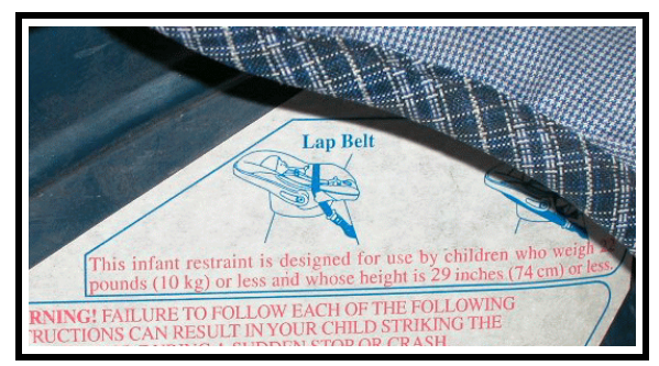
Figure 13 . Vehicle seat belt routing (lap belt position)