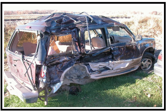
Figure 4. Right rear, case vehicle

southwest. The other vehicle slid a short distance before coming to rest facing northwest.