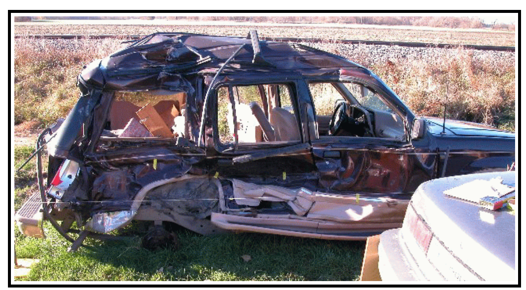
Figure 10. Right side, case vehicle

The case vehicle sustained 267.0 cm (105.1 in) of direct contact damage that began 81 cm (31.8 in) rear of the front axle. The residual crush measured above the sill was as follows: C1=0 cm (0 in), C2=48.0 cm (18.9 in), C3=46.0 cm (18.1 in), C4=45.0 cm (17.7 in), C5=13.0 cm (5.1 in), C6=0 cm (0 in). The maximum crush was 48.0 cm (18.9 in) and was located at C2. The principle direction of force was within the 9 o'clock sector and was an estimated 80 degrees. There was intrusion along the entire right side.