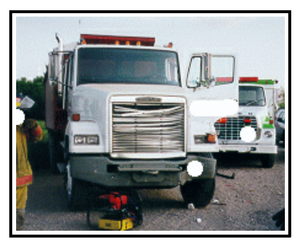
Figure 5. Front, other vehicle

The rear middle seat occupant was ejected through the rear window during the clockwise vehicle rotation. He remained harnessed to the infant seat. His final rest position was in the eastern ditch that paralleled the roadway. He sustained a minor facial contusion on the left side of the upper lip, edema on the left lower side of the lower jaw, forehead abrasions, and multiple minor puncture wounds. He was transported by ground ambulance to a local hospital and arrived at 1830 hours. He was hospitalized overnight as a precaution.