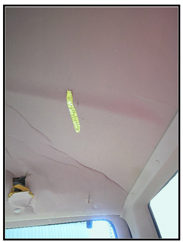
Figure 20. Marks along roof from ejected occupants