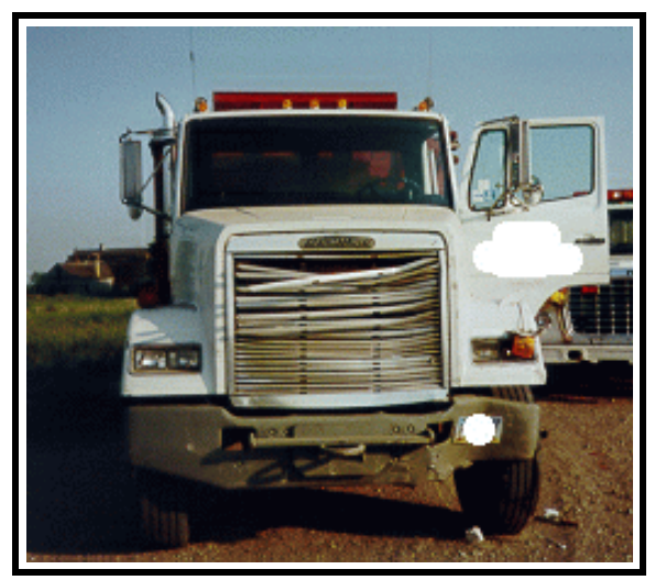
Figure 14. Front, other vehicle