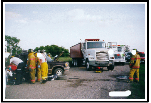
Figure 2 . Final rest for both vehicles (looking south)

The case vehicle rotated in a clockwise direction and came to rest near the east ditch facing