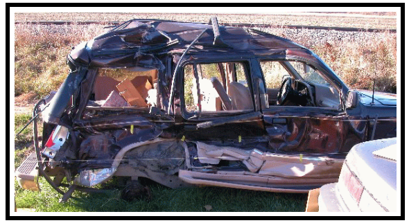
Figure 3. Right side, case vehicle