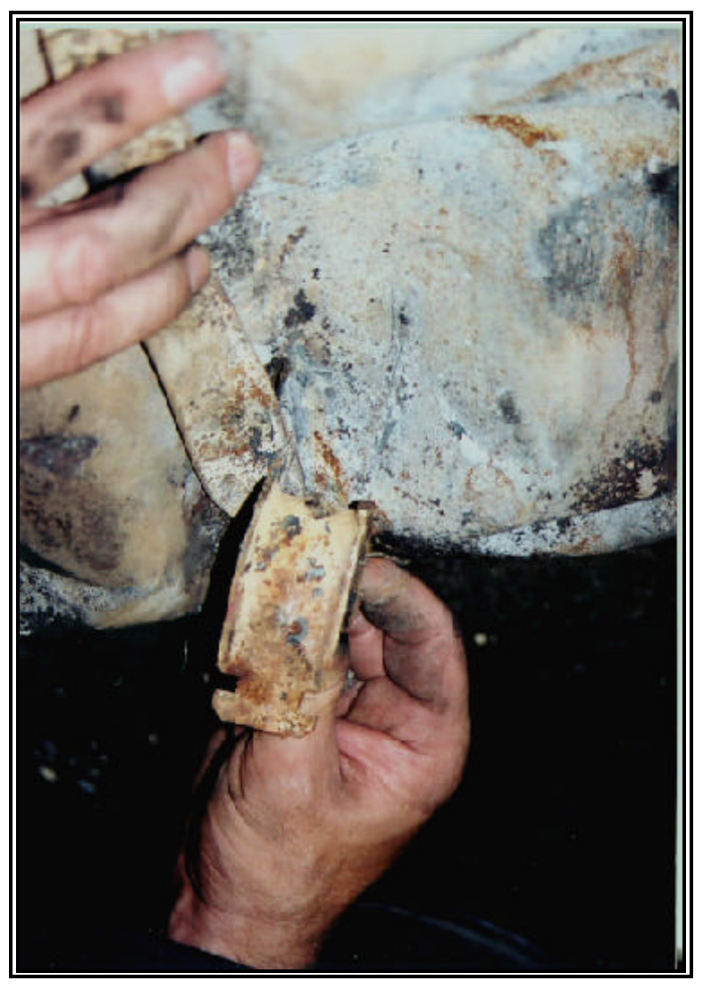
Figure 19: View of the contact between the tank, carry strap and left rear sway bar bracket.