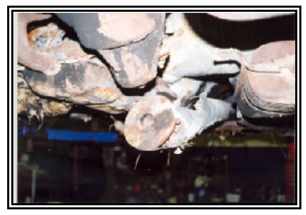
Figure 4: Drive shaft deformation.

Scuff marks attributed to the Chevrolet's left front tire and the left trailer tires, respectively, identified the trajectory of the Chevrolet. As the Chevrolet departed the road, the front cross member bottomed out in ditch as it continued to final rest.