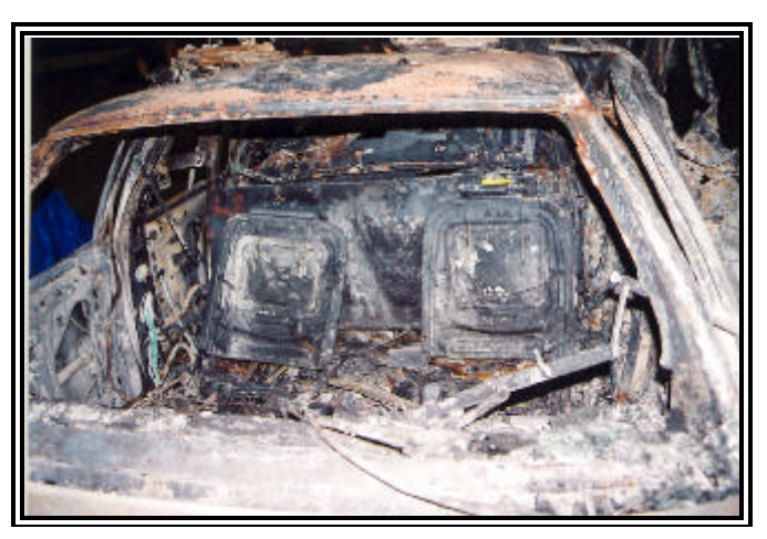
Figure 6: View through the windshield opening of the front interior.

the B-pillar and the left C-pillar was crushed forward within 18 cm (7 in) of the left B-pillar. The left front door was jammed shut. The right rear door was fully intact and was jammed shut due to the deformation of the vehicle's frame. The right front door was operational and was used to remove the injured Trooper. The trunk space collapsed and its contents crushed forward due to the impact. The deformation extended forward through the rear occupant space, forward to approximately the front seat backs. The fire consumed everything that was combustible in the vehicle and it was a total burn, Figure 6 .