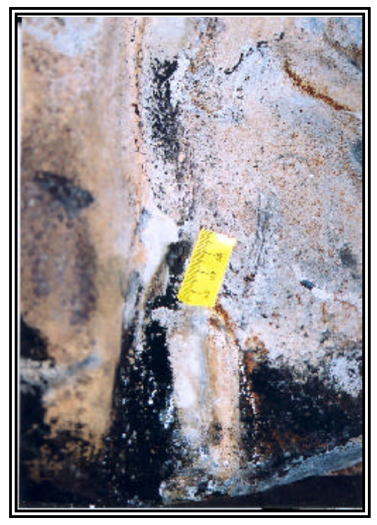
Figure 18: Close-up view of the puncture/cut.

During the deformation of the vehicle, the forward side of the tank contacted the rear axle and left rear sway bar bracket and shock absorber mount. The mechanism that caused the puncture of the fuel tank was contact between the fuel tank, the tank's left carry strap and the left sway bar bracket. Refer to Figure 19. Two impressions from the outer edges of the bracket were visible in the tank as a result of the contact. Additionally, the edge of the carry strap in the area of the hole was rolled over and there was a sharp burr. It should be noted, the inboard side (right edge) of the bracket caused the tank puncture. The Technical Safety Bulletin (TSB) issued by Ford on October 21, 2001 addressed grinding the tabs on the outboard (left side) of the bracket (relative to the vehicle). This service was performed on the subject vehicle. The evidence of compliance with the TSB can be seen on the left edge of the bracket in Figure 19.