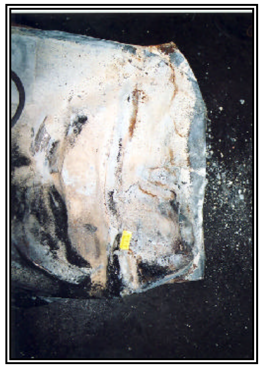
Figure 17 : View depicting the location of the puncture/cut on the left side of the tank.