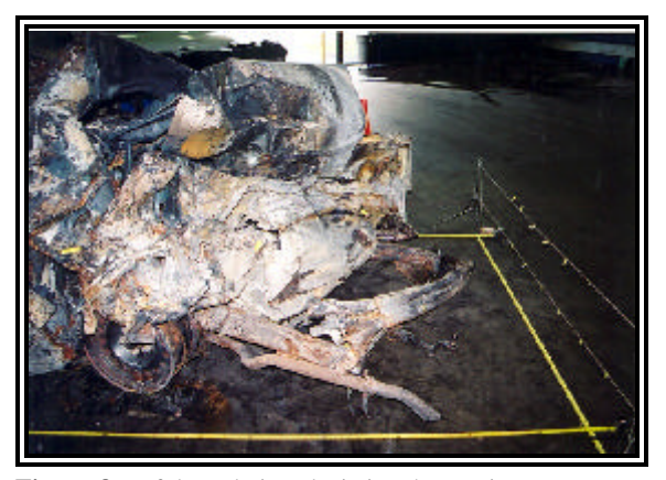
Figure 8 : Left lateral view depicting the maximum deformation.