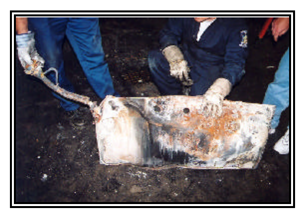
Figure 14 : Filler neck and fuel tank after removal from the vehicle.

The deformation of the fuel tank was biased to its left side. The damaged tank did not have a large reduction in its volume. Two large creases were noted on the left forward side of the tank from direct contact with the left lower shock absorber mount. The creases measured approximately 11.4 cm (4.5 in) in length. No punctures in the tank were identified prior to its removal.