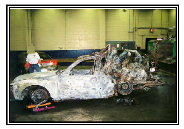
Figure 5: Left side view of the Ford.

The 1998 Ford Crown Victoria, Figure 5 , was identified by the partial Vehicle Identification Number (VIN): 2FAFP71W5WX (Production sequence deleted). The VIN plate at the left forward aspect of the windshield was partially destroyed by the fire. The State Police reported the vehicle's odometer had recorded approximately 175,424 km (109,000 miles). The 4-door, body-on-frame, sedan was equipped with the Police Interceptor Package. A class II trailer hitch with a 3.2 cm (1-1/4 in) receiver was mounted between the frame rails below the rear bumper.