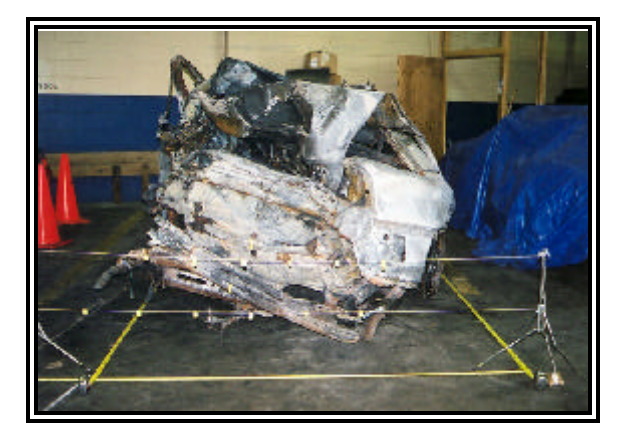
Figure 7: Rear view of the Ford.