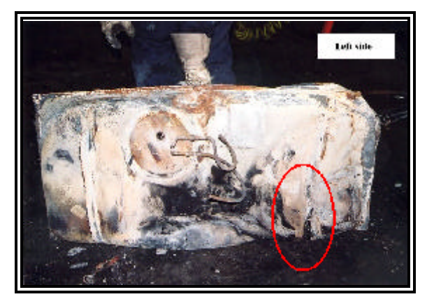
Figure 15: View of the forward side of the tank.

Figures 15 and 16 are overall views of the tank after its removal from the vehicle. A distinct burn pattern was noted on the rear side of the tank (refer to Figure 15). Close inspection of the tank identified a small vertically oriented puncture/cut in the area of the left tank strap on the forward side of the tank. The area in question is highlighted in red in Figure 14. The hole measured 11.1 mm (0.43 in) long by 1.5 mm (0.06 in) wide. Figures 17 and 18 are progressively closer views of the puncture/cut.