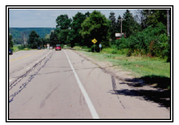
Figure 2: Post-crash trajectory of the vehicles.

approximately 9 m (30 ft) east of the road edge. An overhead utility line crossed the road immediately north of the crash and was hanging down. The height of the downed wires measured approximately 3 m (10 ft) and were being clipped by passing tractor/semi-trailer trucks. Figures 2 and 3 are views of the post-crash tire and gouge marks and the final rest location of the Ford, respectively.