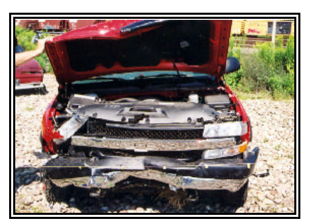
Figure 11: Front view of the Chevrolet.

The front plane of the Chevrolet sustained 136.0 cm (53.5 in) of direct contact damage that began 53 cm (21 in) left of the vehicle's center line and extended to the right front bumper corner, Figure 11 . The combined width of the direct and induced damage extended across the entire 165 cm (65 in) frontal end width. The residual crush profile was as follows: C1 = 0, C2 = 9.0 cm (3.4 in), C3 = 22.0 cm (8.8 in), C4 = 32.0 cm (12.5 in), C5 = 24.0 cm (9.5 in), C6 = 28.0 cm (11 in). The Collision Deformation Classification (CDC) was 12-FDEW-2.