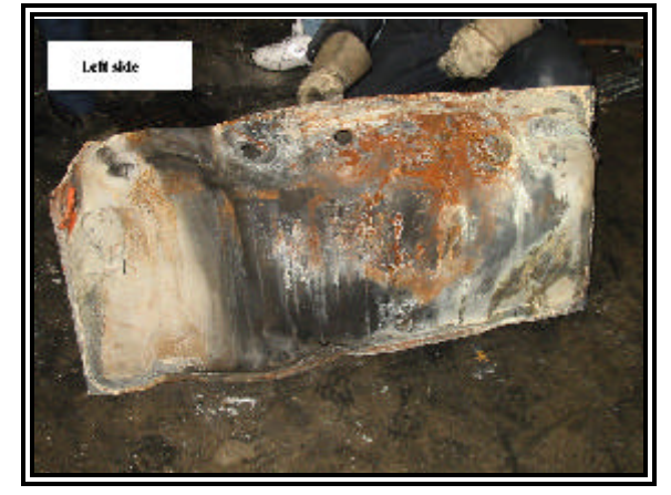
Figure 16: View of the rear side of the tank.