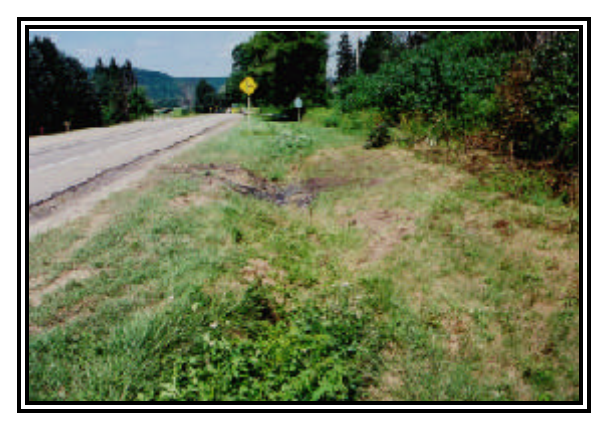
Figure 3: Final rest area of the Ford.