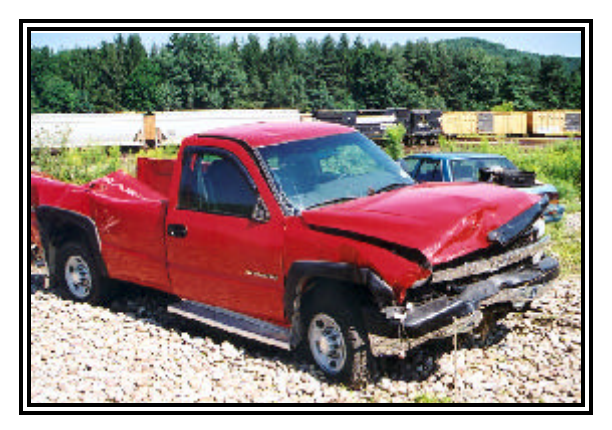
Figure 10: View of the damaged Chevrolet.

The Chevrolet was hauling a gooseneck trailer with two head of cattle at the time of the crash. The trailer