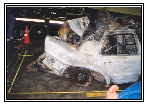
Figure 9: Right rear deformation.