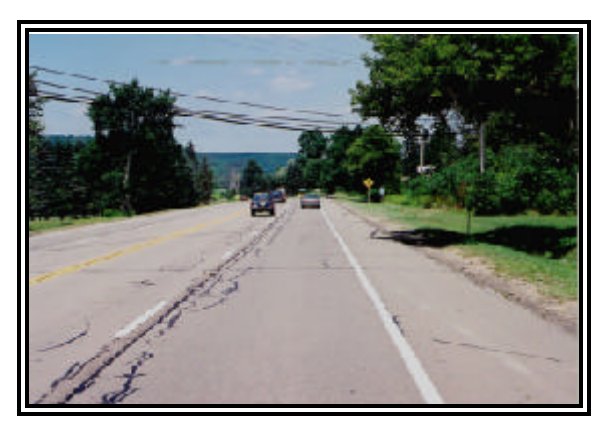
Figure 1 : Northbound trajectory view approaching the impact.

This two-vehicle crash occurred during the afternoon hours of August, 2002. At the time of the crash, it was daylight and the weather was clear. The road surface was dry. The crash occurred in the outboard northbound lane on a north/south, four lane state highway, Figure 1 . The roadway was straight and level in the area of the crash with approximately 275 m (900 ft) of sight distance. The travel lanes were bordered by a 2.4 m (8.0 ft) wide shoulder. A shallow ditch was located 4.6 m (15.0 ft) east of the shoulder and had a estimated depth of 0.6 m (2.0 ft). A large area of small diameter trees and brush began