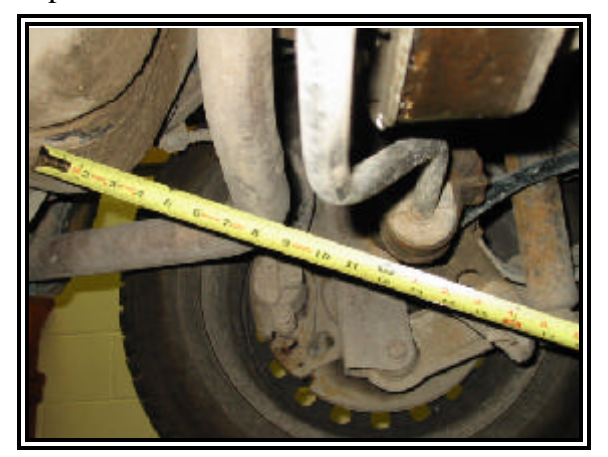
Figure 13: Distance between sway bar bracket and the fuel tank.

filler door was displaced forward 50.3 cm (19.8 in). The residual location of the filler door was 12.5 cm (5.0 in) forward of the post-crash left rear axle location. There was no separation of the filler neck from the tank during the crash, Figure 14 . Approximately 14.7 cm (5.8 in) of the filler neck remained within the tank. The non-combustible portion of the filler cap was threaded into the neck at the time of the inspection.