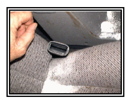
Figure 16. Passenger's buckle sleeve at inboard aspect of seat cushion.

The SCI inspection of the buckle assembly found the buckle unit intact with the top mounted release button spring loaded and operational. The webbing tether had separated from the lower anchorage bracket which remained bolted to the seat frame bracket. The webbing tether was cut in an irregular pattern above the lower anchorage bracket. That is, removed from the vehicle, the outboard aspect side of the webbing tether (side exposed to the inboard aspect of the seat cushion) was shorter in length than the opposing aspect. The outboard aspect of the webbing tether measured 9.0-10.0 cm (3 9/16 - 3 15/16") in length from the base of the buckle unit to the frayed cut points. The opposing length ranged from 11.1-11.7 cm (4 3/8-4 5/8"). All stitching remained intact and was located above the cut location. Figure 17 is a view of the partially retracted passenger's belt system.