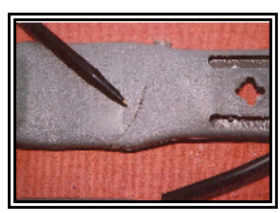
Figure 21. Cut line on the passenger's buckle sleeve.