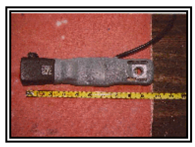
Figure 20. Gouges on the driver's side buckle sleeve.