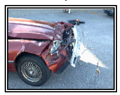
Figure 13. Profile view documenting the extent of frontal crush.

Crush profiles were documented at the level of the bumper and the hood face due to the underride and averaged for the WinSMASH reconstruction program. The bumper profile was as follows: C1 = 13.7 cm (5.4"), C2 = 17.8 cm (7.0"), C3 = 21.0 cm (8.25"), C4 = 22.2 cm (8.75"), C5 = 22.2 cm (8.75), C6 = 20.8 cm (8.2"). The profile at the leading edge of the hood was as follows: C1 = 1.0 cm (0.4"), C2 = 37.8 cm (14.9"), C3 = 46.5 cm (18.3"), C4 = 47.2 cm (18.6"), C5 = 43.4 cm (17.1"), C6 = 45.7 cm (18.0").