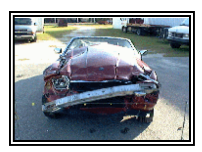
Figure 12. Frontal damage to the Jaguar XJS.

cm (9.0") upward while the right was displaced 11.4 cm (4.5"). The bumper energy absorbing devices (EADs) compressed and returned to the original pre-crash positions. Due to the vertical displacement of the rails, these units bound, thus limiting the stroke of the EADs. The left compressed 1.0 cm (0.4") while the right compressed 3.8 cm (1.5"). Figure 13 is a profile view of the right front area of the Jaguar documenting the extent of frontal crash. The CDC for the frontal impact event was 32-FDEW-2. The 12 o'clock direction of force was incremented by a value of 20 for the vertical displacement.