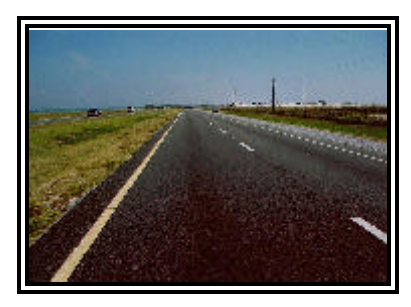
Figure 2. Overall view of the crash site at the initial point of impact.

The crash occurred on a four lane divided U.S. Route that consisted of two lanes in each of the east and westbound travel directions. A shallow depressed 8.5 m (27.9') sand median with sparse grass coverage separated the travel lanes. The eastbound travel lanes were 3.6 m (11.8') in width and were bordered by a 1.4 m (4.6') paved south (outboard) shoulder and a 0.6 m (2.0') inboard paved shoulder. An additional 3.7 m (12.1') wide crushed stone shoulder bordered the outboard shoulder. A grass and sand area extended beyond the stabilized shoulders with a wire fence paralleling the roadway located 13.1 m (43.0') outboard of the stone shoulder. Figure 2 is an overall view of the crash site at the initial point of impact.