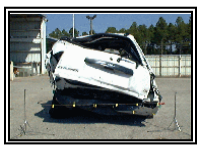
Figure 7. Rear impact damage to the Ford Explorer.

(58.0") along the damaged profile. The impact deflected the bumper downward, rotating the face of the bumper to a near 90 degree attitude. The crush profile, by protocol, was measured at the mid plane of the bumper face and was as follows: C1 = 33.7 cm (13.25"), C2 = 32.0 cm (12.6"), C3 = 33.8 cm (13.3"), C4 = 34.5 cm (13..6"), C5 = 21.0 cm (8.25"), C6 = 6.1 cm (2.4"). Figures 7 and 8 depict the damage to the rear of the Explorer.