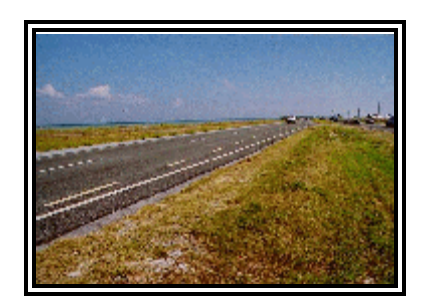
Figure 4. Rollover trajectory of the Ford Explorer.

The Explorer continued to roll in a lateral mode across the westbound lanes as its center-of-gravity continued in a northeasterly direction ( Figure 4 ). Two distinct gouge marks were present in the inboard westbound lane. The eastern most gouge mark was a semi-circular gouge indicative of a wheel impact to the pavement surface. The Explorer continued to roll across the westbound lanes and shoulders, coming to rest in an upright attitude 64.5 m (211.6') east of the trip point which initiated the rollover. It should be noted that the front right female passenger of the Ford Explorer was restrained by the 3-point lap and shoulder belt system, however, due to a belt system failure, she was partially ejected through the right front door window opening