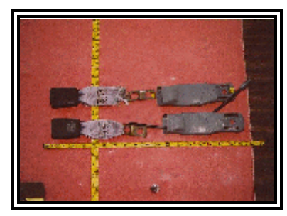
Figure 19. Removed buckle assemblies; top - passenger; bottom - driver.

several days following the crash. During the SCI inspection of the vehicle, the front right latchplate was engaged into the buckle assembly and the components locked and released manually as designed.