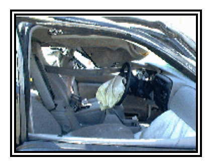
Figure 11. Front right passenger compartment.

The front right and rear right occupant positions were minimally intruded by deformation of the roof structure ( Figure 11 ). The vertical displacement of the right roof side rail was approximately 2.5 cm (1.0") while the roof panel was deflected upward as a result of lateral displacement of the left upper A-pillar. The right corner of the front bumper contacted the ground during the rollover event. The damage began 39.4 cm (15.5") right of center and extended 36.8 cm (14.5") to the right corner. This damage was the only direct contact damage to the frontal plane of the vehicle.