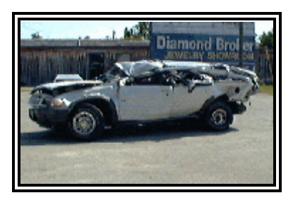
Figure 9. Left side rollover damage to the Explorer.

the vehicle. Figures 9 and 10 are side views of the Explorer documenting the severity of the rollover damage.