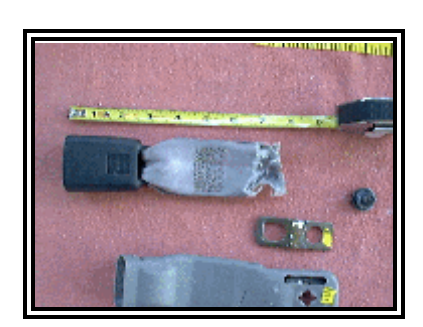
Figure 22. Cut passenger's side buckle tether.