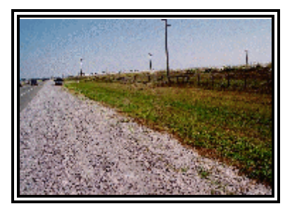
Figure 5. Off-road trajectory of the Jaguar.

of the south edgeline of the eastbound travel lanes. The total yaw travel distance for the vehicle was documented by the SCI investigator at 104.6 m (343.2').