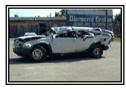
Figure 1. Rollover damage to the 2000 Ford Explorer.

This on-site investigation focused on the release of the front right 3-point lap and shoulder belt system in a 2000 Ford Explorer XLS Sport, 4-door sport utility vehicle. The Explorer was occupied by a 22 year old male driver and his 22 year old wife of approximately six hours, seated in the front right position. Both occupants were restrained by the manual 3-point lap and shoulder belt systems. The Ford Explorer was traveling on the inboard travel lane of a four lane divided U.S. Route at a driver estimated speed of 89 km/h (55 mph). A 1992 Jaguar XJS V-12 convertible was traveling behind the Explorer at a high rate of speed estimated by the investigating officer