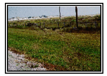
Figure 6. Clockwise yaw trajectory of the Jaguar with reverse hook of the yaw marks.