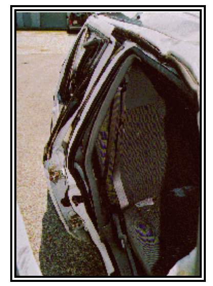
Figure 17. Post-crash position of the retracted right front belt system.

extended laterally across the sleeve from a point that began 0.6 cm (0.25") above the lower side of the sleeve to 0.3 cm (0.125") beyond the midpoint of the sleeve.