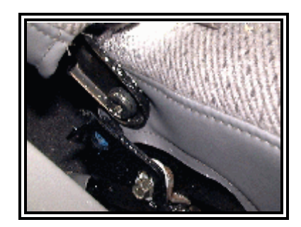
Figure 14. Driver's side inboard seat back support bracket.

The outboard aspect of the buckle sleeve extended vertically from the attachment point at a forward angle along the inboard aspect of the seat cushion/seat back support. The seat back was attached to the cushion frame by a stamped U-channel bracket ( Figure 14 ). This bracket was 3.2 cm (1.25") in width. The edges of the U-channel protruded outward from the body of the bracket by approximately 0.6 cm (0.25"). These edges were exposed (unprotected) to the outboard aspect of the vinyl sleeve of the buckle. When not in use, the sleeve was positioned away from the edges of the U-channel, however, when loaded, the sleeve engaged against the edges of the bracket.