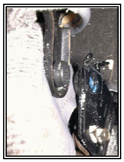
Figure 18. Inboard passenger's seat back rest support bracket.

During the early phase the rollover crash sequence, the driver loaded his belt system which engaged the buckle sleeve against the seat back support bracket. Two to three separate load pulses were transmitted into the buckle sleeve as evidence by the gouge marks in the vinyl ( Figure 20 ). He was subsequently ejected from the vehicle with the belt system remaining buckled and intact.