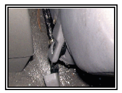
Figure 15. Sleeve/buckle attachment viewed from rear aspect of passenger's seat.

The front right passenger's belt system was configured the same as the driver's belt system. The adjustable D-ring was found adjusted to the top position during the SCI inspection of the Ford Explorer. The buckle sleeve was present and attached to the inboard aspect of the front right seat track ( Figures 15 and 16 ). The buckle and tether webbing had separated from the sleeve and was retrieve by the legal team's investigators and placed in a sealed in plastic bag. It should be noted that the front right passenger's seat back rest was reclined to a measured angle of 40 degrees aft of vertical.