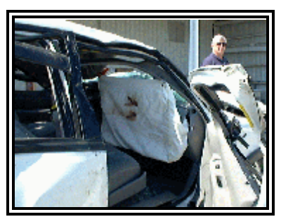
Figure 23. Blood stain on the front right passenger air bag.

The front right passenger air bag deployed from a mid mount module in the right instrument panel. A single, top hinged cover flap concealed the bag within the module assembly. The front right air bag was not tethered or vented directly into the passenger compartment. The overall dimensions of the air bag were 55.9 cm (22.0") horizontally and 48.3 cm (19.0") vertically.