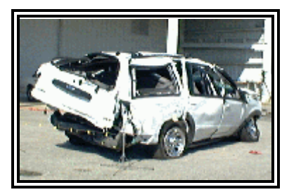
Figure 8. Right threequarter view of the rear damage.

The 6 o'clock direction of force impact displaced the rear structure forward, compressing the rear leaf springs and the spare tire against the rear axle. The main leafs of the rear springs were bent in a U-configuration and the top mount of the left rear shock absorber was fractured by the damage. The spare tire separated from the undercarriage carrier during the crash. The OEM steel rim of the spare tire was deformed and the tire was fully deflated with the bead separated from the wheel. The Collision Deformation Classification (CDC) for this event was 06-BDEW-3.