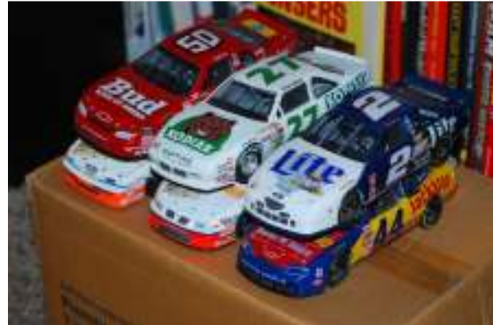
Refurbished models waiting to go back on display.

so many obviously most use aftermarket decals. So whoever built these put considerable time and effort into the builds. One thing I want to do is see if the builder can be identified so we can acknowledge his work. If anyone reading this is aware of someone who lived or maybe moved to the Albuquerque area or New Mexico and donated these about 15-20 years ago please contact me.