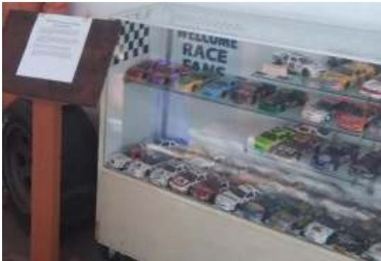
One of the display cases of NASCAR models

Among the models that have been donated is a collection of NASCAR models. We do not know the name of the donor and builder. But it is a significant stash, so far I have found at least one hundred. These are from the mid 1980s to early 2000s. Most are Revell and Monogram 1/24 but there are some AMT and MPC 1/25 kits too.