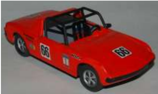
Description: Porsche 914/6 Manufacturer: Revell Scale 1/25 Kit H1317 by Chuck Herrmann

This car combines two of my favorite auto brands, Porsche and VW. It was a mid-engined sports car designed, manufactured and by Volkswagen and Porsche from 1969 to 1976. VW needed a sporty car to replace the Karman Ghia, and Porsche wanted an entry level model to replace the 912. So they joined efforts. In the US they were only sold under the Porsche brand. It was only available as a targa topped two seat roadster powered by either a flat-4 or flat-6 engine.