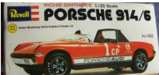
Other releases of this kit – the orange one acted as my inspiration.