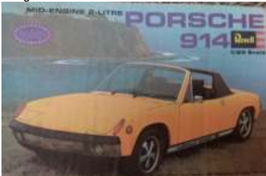
Revell issued a model, kit 1317, in 1970. There were several subsequent reissues, some including race car parts (because all Porsches eventually get raced!)

This car combines two of my favorite auto brands, Porsche and VW. It was a mid-engined sports car designed, manufactured and by Volkswagen and Porsche from 1969 to 1976. VW needed a sporty car to replace the Karman Ghia, and Porsche wanted an entry level model to replace the 912. So they joined efforts. In the US they were only sold under the Porsche brand. It was only available as a targa topped two seat roadster powered by either a flat-4 or flat-6 engine.