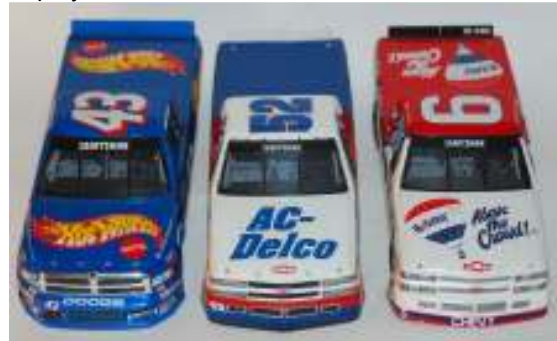
Three examples of Nastrucks.