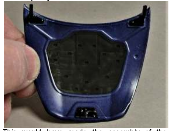
This would have made the assembly of the interior more difficult and I wanted to enter this in model contests, so I made it removable by cutting off the hood hinge lower parts.

None were too serious and I was able to prime and sand them out. The body featured had separate door handles and mirrors. A three piece hood was supposed to be held in place at assembly by two tabs under the dash.