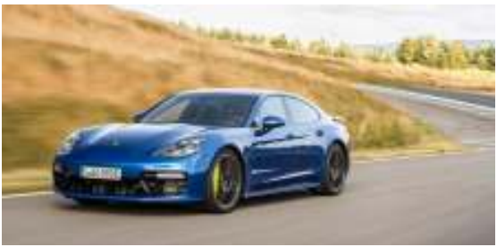
The real thing on the road.