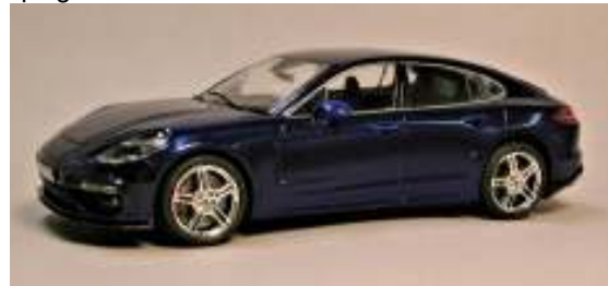
I plan to enter this model in contests and will place it in the out of box or box stock category

After painting and clear coat I brush painted the interior headliner and under the hood area. The instructions for painting were very detailed and there were even some more decals to put on the headliner where they cannot be seen after assembly. Painting the rear tail light casting was tricky because there is a black area in the center as well as some chrome around the red LED light area. There are five decals on the back of the Panamera, a German license plate, a PORSCHE logo, a Panamera Turbo decal and two red back up light decals.