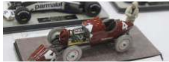
Here are some other race class models.