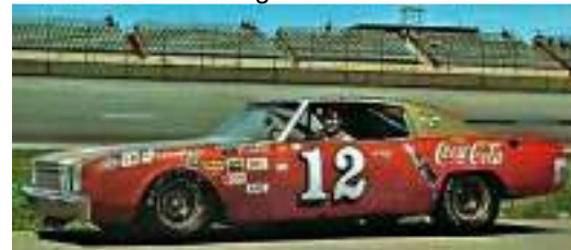
Below - the real thing