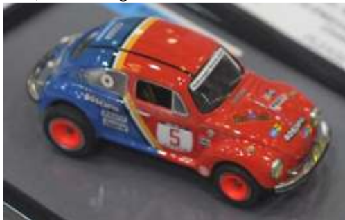
One of the special awards was for Best VW, here is the winner.