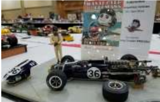
Above is a photo of the Best Automotive trophy winner, a 1/20 Eagle Grand Prix race car.

http://svsm.org/gallery/chattanooga2019-awards?fbclid=IwAR2Zxx8zrtTaXeuZJBh4oUHj-Wan5UJsfH4HZKQwM4uipv_SBGWU2nWHvQs