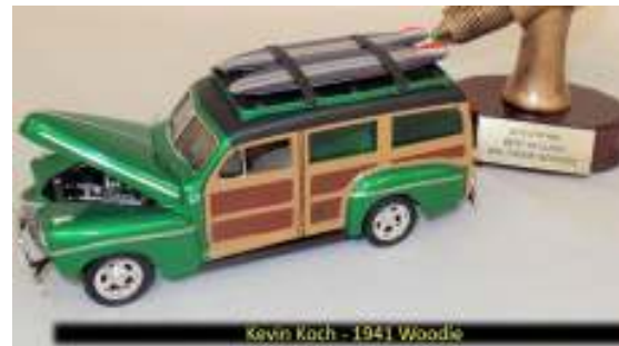
Theme – Best Woody Kevin Koch