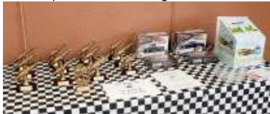
The spark plug style trophies were pretty cool!