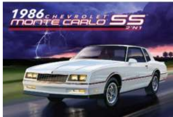
The 1986 Chevy Monte Carlo is being reissued.