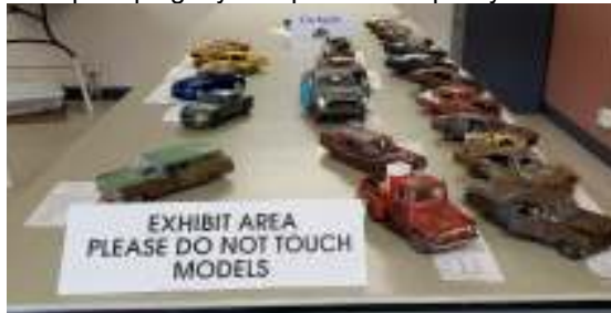
Display tables filling up.