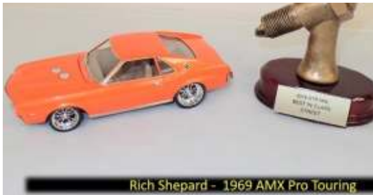
Rich Shepard - 1969 AMX Pro Touring Street – Rick Shepard, 1969 AMX Pro Touring