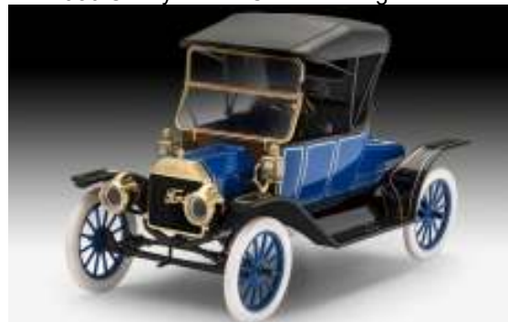
Revell Germany has announced a 1913 Ford Model T kit. This appears to be based on the ICM tooling already found in several ICM kits.