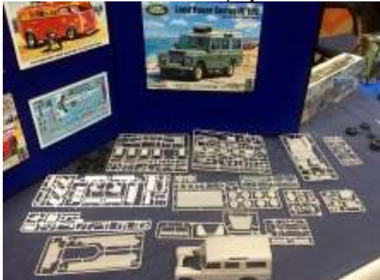
This Land Rover new tool looks interesting.