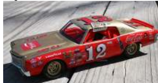
Above - internet photo of a completed kit.

So if you're into building vintage historic NASCAR models, this kit belongs in your collection. Grab one, and end the summer with a bang! ED