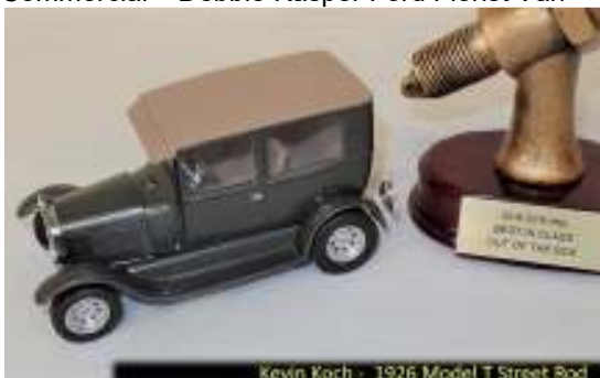
Kevin Koch - 1926 Model T Street Rod Out of the Box – Kevin Koch 1926 Ford Street Rod