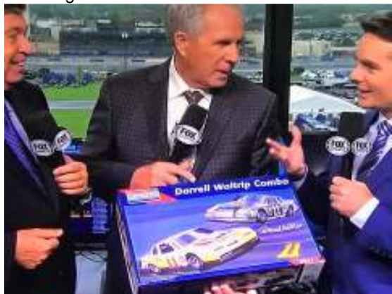
I would like to see his build ups!