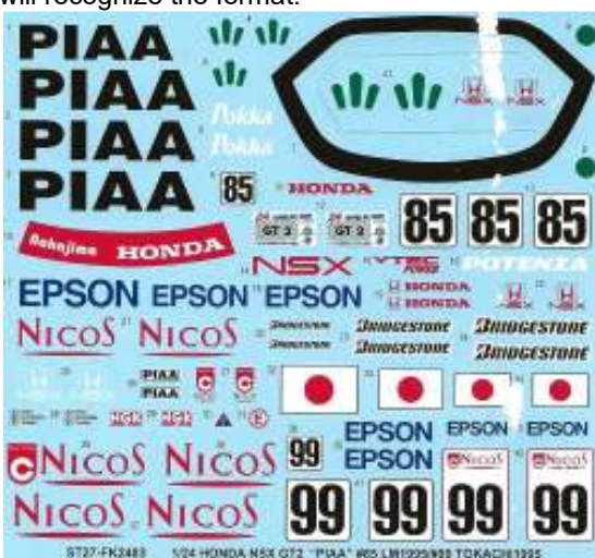
The nice decal sheet includes the LeMans Test Day car #85 as well as a Japanese GT series car, #99.