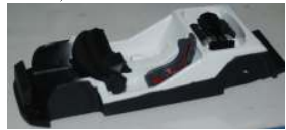
Chassis: The chassis is a flat bottom resin piece with the interior tub details molded on top. There is no chassis or suspension detail. The chassis attaches to the body with screws.