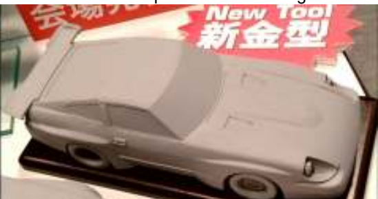
Mazda RX7 IMSA