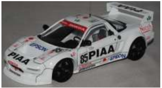
The decals, even though they are about twenty years old, worked great. They took a while to come off the paper but went on nicely.

Body: The body is resin. There is an option for open or closed headlights. My kit as purchased came slightly started, with the headlights glued in the closed position and a poor coat of white. I left the headlights closed, and sanded off the rough spots of the paint job. Then I sprayed on Dupli Color White primer, sanded it smooth and then sprayed on Testors Classic White from a rattle can. The rear wing supports were thin photoetch but they hold up the whitemetal rear wing fine. The wing endplates are photoetch. I was worried about the clear windshield; on some resin kits it requires cutting individual pieces. But here it was one piece, just needed trimming in the front. It mounted under the roof and CA held it no problem. Rear taillights were an odd type of clear plastic which had yellowed with age but Tamiya Clear Red looks good. The exhaust tips are whitemetal I painted aluminum. There are two diffuser sections, photoetch pieces which were tricky to attach.