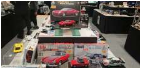
Most major companies were there, above is a display of upcoming Italieri kits.