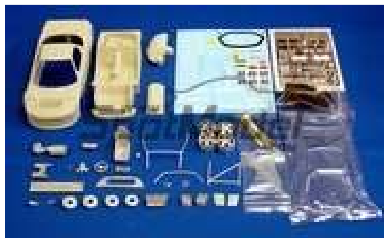
If you have ever built a Starter 1/43 kit, you will recognize the format.

The Kit: This is a multi media kit, with resin, cast whitemetal, vacuumform and photoetch parts.