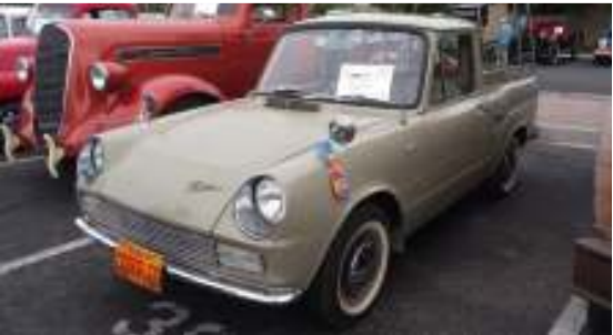
I had never seen a 1967 Toyota Publica pickup before.