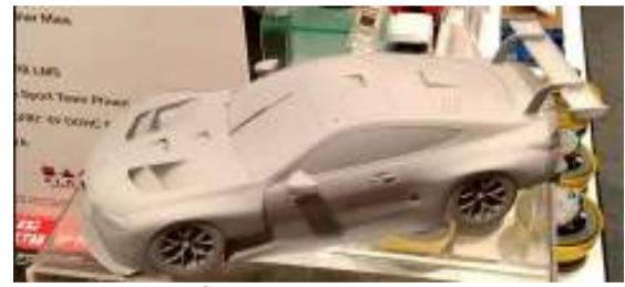
Audi BMW M8 GTE