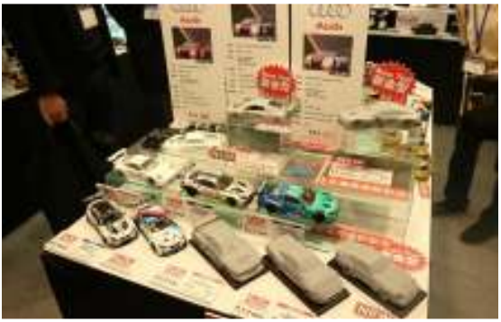
Also NuNu Platz keeps new stuff coming.

For race car fans, Aoshima/Beemax remains the most active as far as new product. They had a large presence at the event, and several new kits were announced.