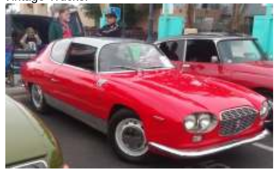
The Albuquerque Model Car Club was also represented in 1:1 scale. Above Joe Ballengee's Lancia, below is Eddie Corbins 26 Ford.

It was bit cool for the season, and overcast, but it was a good day to stroll among the many great cars on display. There were probably 300-400 on display, a great mix of all styles. Theme was Vintage Trucks.