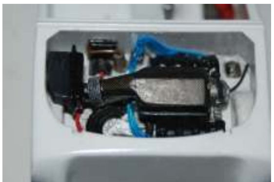
Engine: The bottom of the engine is molded into the engine bay which is the top of the chassis. The only detail is the whitemetal intake plenum. I painted the engine top aluminum. The plenum I painted semi gloss black then used parts box carbon fiber decals. The engine compartment looked pretty sparse so I added some wires and bits. It is close but not entirely accurate but it punches up the engine room which is visible through the rear window.