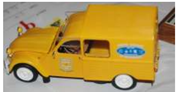
Ebbro Citroen Fourgonnette delivery