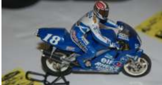
Racing motorcycle (1/24)