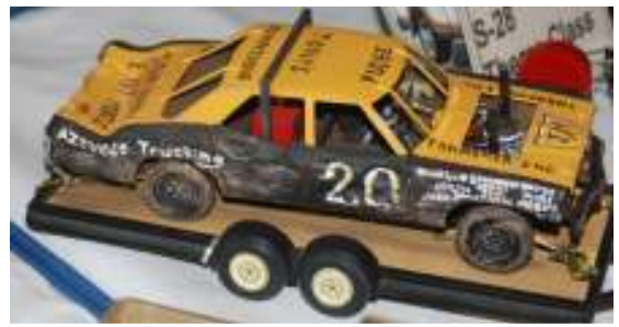
Beat up local short track stocker