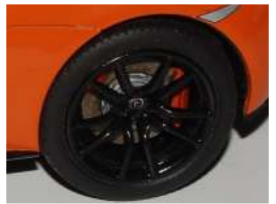
There are disc brakes, I painted them Testors Jet Exhaust with orange calipers. There is a McLaren decal for the calipers to add some details.

Wheels/Tires: The kit wheels are unplated. I painted then semi gloss black. The real car features multiple options so you can pick your favorite. The tires are vinyl with no sidewall detail. There is a decal for the McLaren logo on the wheel centers.