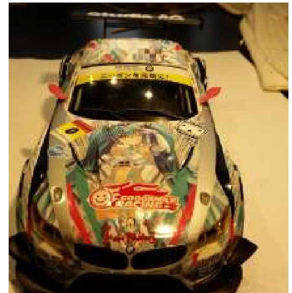
After the anime is all completed, you then apply the second layer of decals which are the sponsor decal and there are a ton of them. After a while, I thought I was putting on 1/48 scale military aircraft stencils. I was very happy that the base decals were not affected by the second layer of decals.

You then need to follow up with each decal in several locations to get the more severe areas to finally settle down. The design of the decals is quite good in that there are a lot of match lines all around the car that need to be perfect and they are.