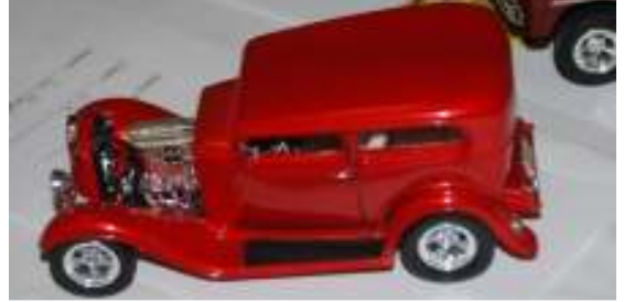
32 Ford Street Rod