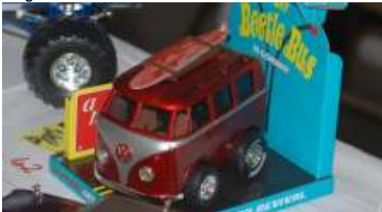
Der Beetle Bus