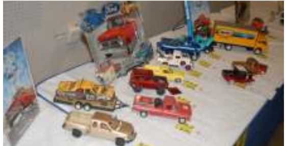
The Theme Award was for 100 Years of Ford Trucks.