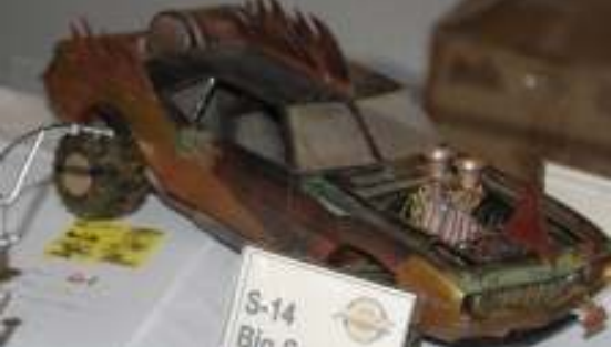
Large scale Road Warrior, class winner