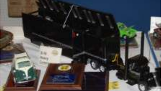
Commercial Winner, also Best of Show, ?Best Detail