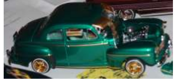
Lowrider class winner, also Best Paint