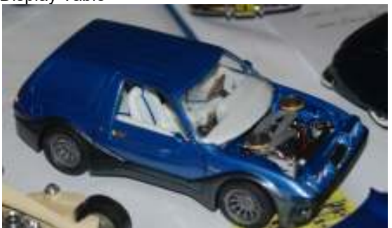
Cutom Class winner, a customized Pacer!