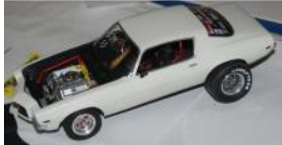
Street Machine class winner