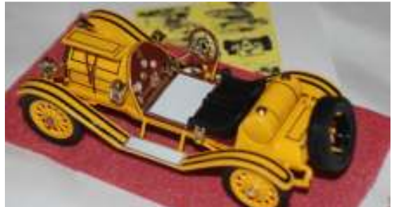
Small Scale Class winner, Pyro Mercer 1/32