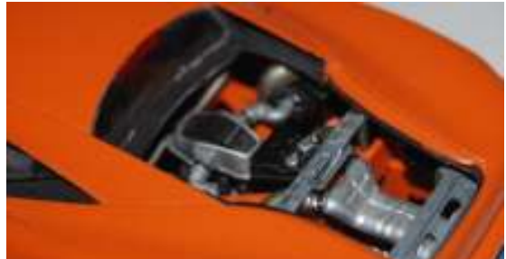
This is the visible engine detail once everything is put together. Below is a photo of the real thing.

The taillights were clear plastic, I painted with Tamiya Clear Red acrylic. Many license plates were offered on the decal sheet but I used some downloaded New Mexico plates. McLaren logo are kit decals.