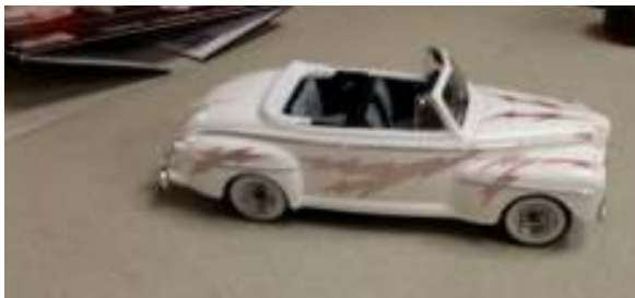
Ed Sexton with Grease 50 th anniversary of the movie 48 Ford