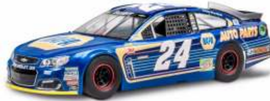
Chase Elliott #24 Chevy SS