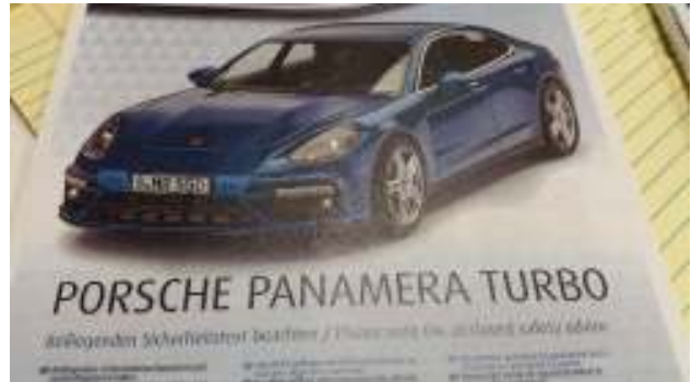
Ed Sexton with a test shot of the Revell of Germany Porsche Panamera