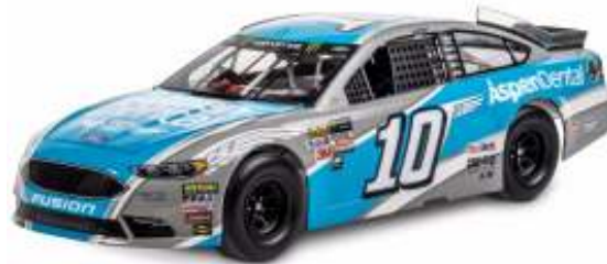
Danica Patrick's #10 Ford Fusion.