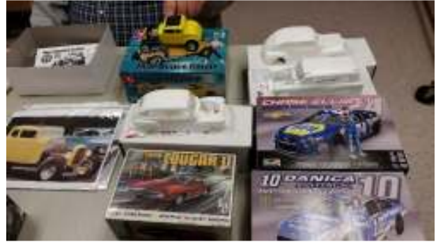
Dave Green with his monthly impressive display of cool stuff

On to Show & Tell. Here are some photos of the models on the tables.