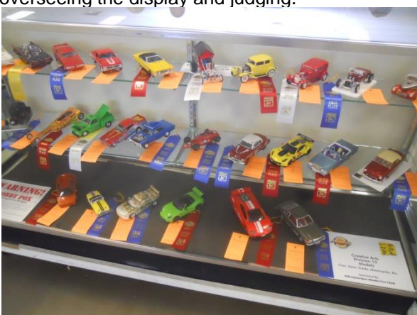
There are separate divisions for Automotive and Military/Figures/Sci Fi.

The local modeling clubs, the Albuquerque Model Car Club and the IPMS/ Albuquerque Scale Modelers, both are heavily involved in overseeing the display and judging.