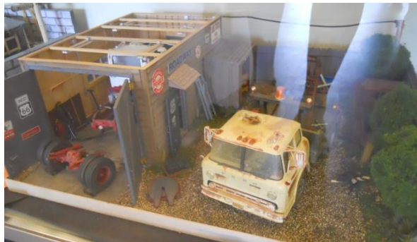
Best Automotive Diorama. (Sorry for the picture quality, they were shot through the glass display cases)