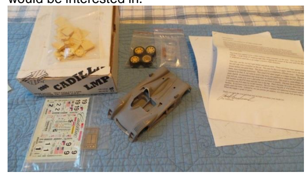
Here is the Cadillac LMP kit.

Several others are in the works and in various stages of creation. While we are unable to provide a timeline for these kits so please watch our Facebook page and website, www.mshobbies.com for more info. Please email us at mshobbies_56@yahoo.com with your thoughts and which of the above listed kit you would be interested in.