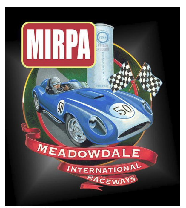
Check out thier webpage at www.mirpa.com