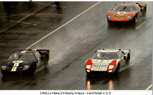
1966 Ford GT Mk II

As noted previously, diehard race fans will probably want more details about the racing without the comments about race drivers facing death every time they race. In that regard this seems aimed more toward general readers. But it was interesting in the description of the US auto industry crisis in the 2008-9 recession and how touch and go the entire situation was. Still, I can give this book a recommended status, 2.5 out of 4 lug nuts.