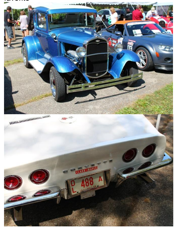
Check out the original 1968 dealer plate and Chicago city tax tag on this beauty