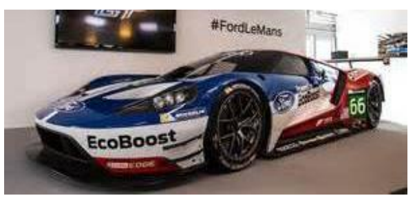
50 Years Later - 2016 Ford GT