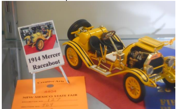
A nicely detailed Pyro 1/32 Mercer.