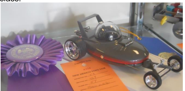
Each overall category has a Best of Show. Here is the Automotive, a scratchbuilt custom built around a computer mouse!