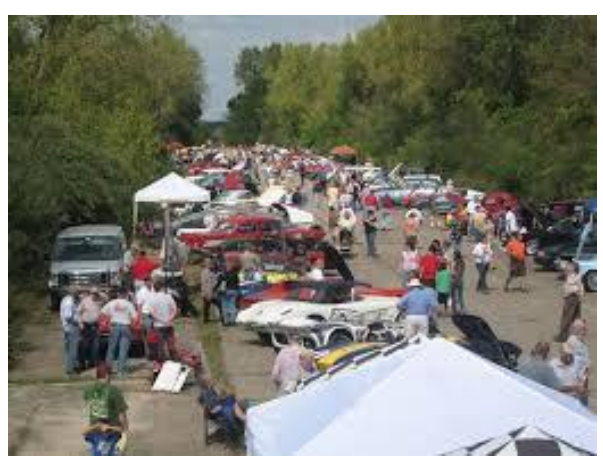
Photos/images are courtesy of the Meadowdale International Raceway Preservation Association website and to whom we thank for the opportunity to be included in the MIRPA annual shows.