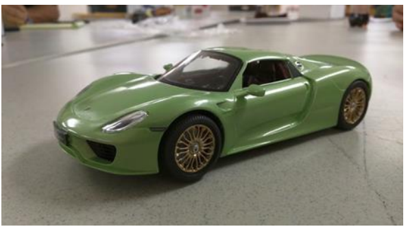
Steve Jahnke - Revell Porsche 918

The September GTR meeting was held on September 2nd. After some business details, it was on to Show & Tell. Here are some photos of the models on the tables.