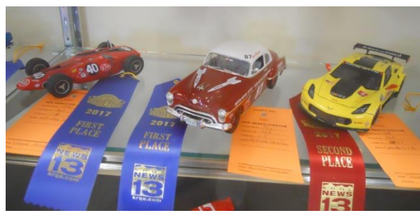
Awards are Blue-Red-White Ribbons for each class.