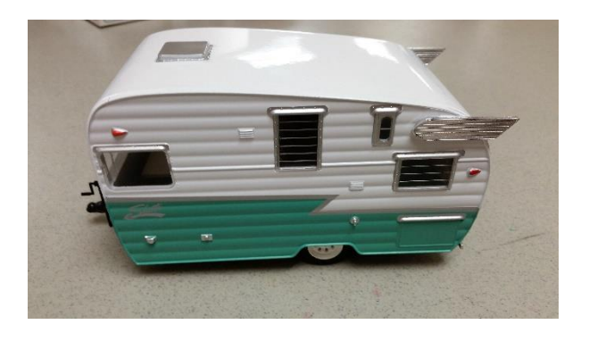
Dave Green: diecast 1959 Shasta trailer