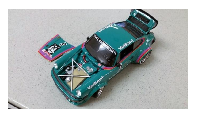
Ed Sexton: the new Revell Germany Porsche 934 kit built by others