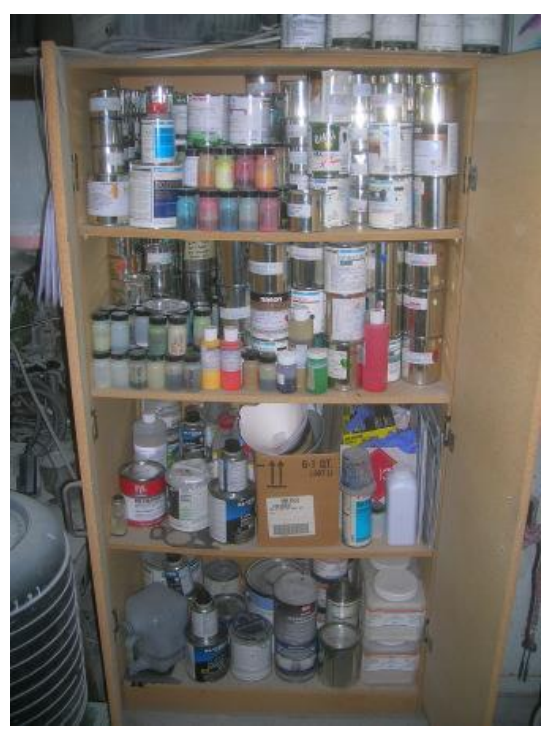
And still more paint...