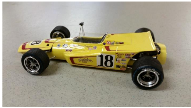
Ed Sexton: 1969 Mecham Petroleum resin kit