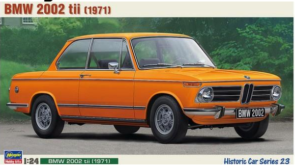
Hasegawa has announced a new tool kit of the iconic BMW 2002.