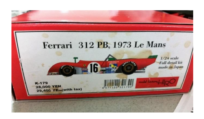
Dave Edgecomb : Model Factory Hiro Ferrari 312 PB kit.

Here are photos of stuff on the tables for Show & Tell.