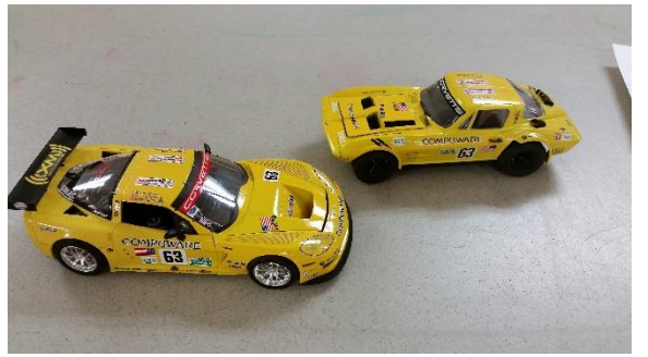
Doug Fisher - Corvette twins