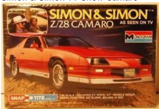
Simon and Simon was a TV detective series from 1981-89.