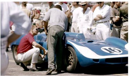
Above is one of the earliest versions.