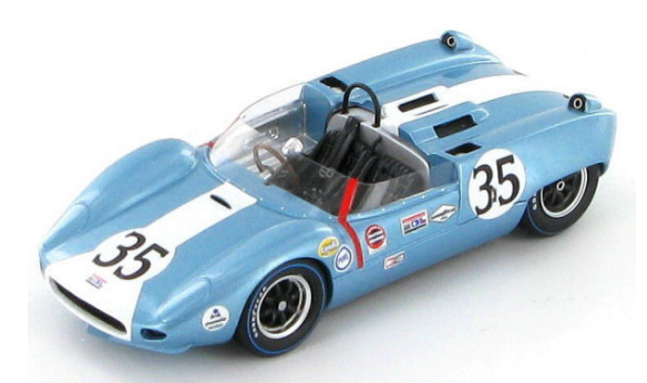
This is the car at Daytona February 1964