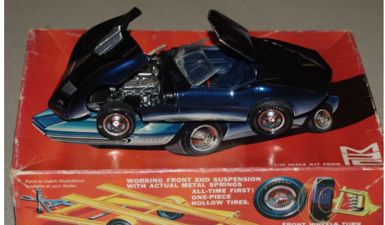
It was started when this kit was a new release, about 40 years ago!!