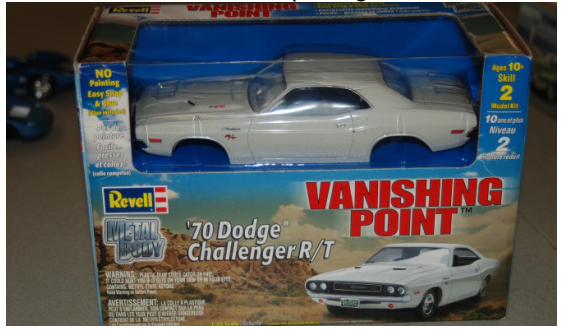
Revell did a prepainted die cast kit of the Vanishing Point Dodge Challenger.

Apparently there was also a truck used in the series. No kit was issued but this internet photo shows one that someone put together.