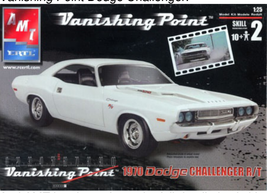
And AMT has just released a full detail plastic kit.