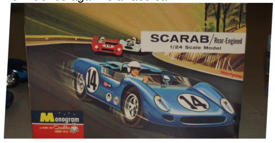
For our 2016 GTR Summer NNL, as part of the Can Am 50 Year theme we also will include some of the earlier cars that lead up to the Can Am series in 1966, like this famous car.