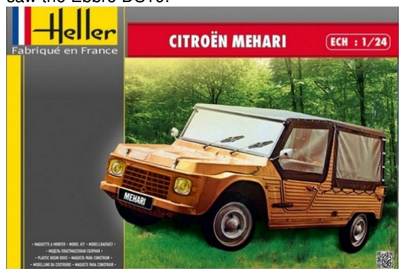
Heller has announced a Citroen Mehari Kit .Nr. 50760

There have been some new Citroen 1/24 kits announced in recent months. Last month we saw the Ebbro DS19.