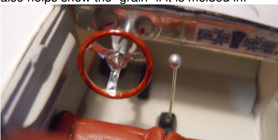
Either Tamiya or Gunze acrylics work fine.

This also is useful for other detail areas. I have used it to replicate wood steering wheels and shifter knobs in interiors. A thinned black wash also helps show the "grain" if it is molded in.