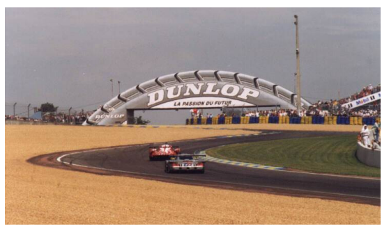
June 13-14 24 Hours of LeMans FR