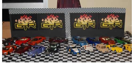
GTR was there with a club display table.

The 23rd Annual Milwaukee N NL, hosted by the Automotive Modelers Group, was held April 11, 2015 in Waukesha, WI.