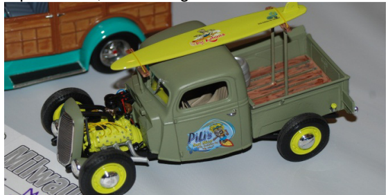
To rat rods, even go karts!