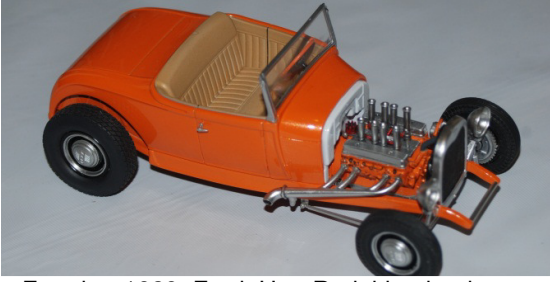
For the 1929 Ford Hot Rod kit, the box art models were there.