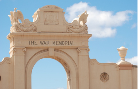
War Memorial, Honolulu, HI