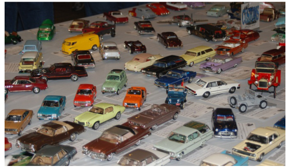
Crowded tables made it hard to soak it all in - sensory overload!