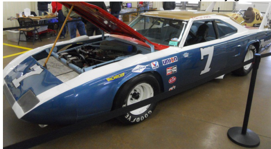
Besides the models in the back room there were some real race cars on display and several tables of racing memorabilia.

GTR had a club table in the vendor room. The turnout was very good, there was a line to get in at the 10:00 start and business was pretty good.