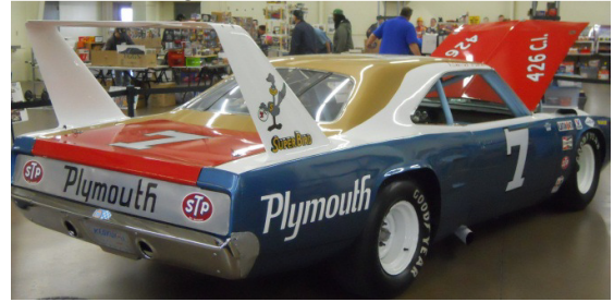
There was a 1970 Plymouth Superbird stock car as driven by Ramo Stott.