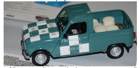
All categories and interests were well represented, from foreign