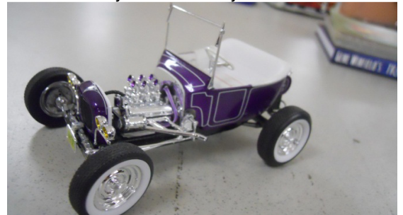
Ed Roth Outlaw.