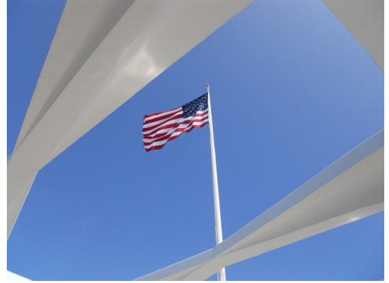
US Flag above the USS Arizona Memorial, Pearl Harbor Hawaii