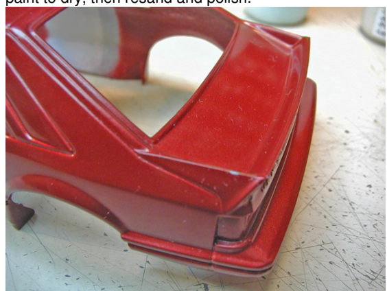
Note the top of the spoiler was polished through.

But wait you say, I was really, really careful and polished through to bare plastic, or I can see where too much pressure was applied to the candy or metallic finish and I can see a difference.....what do I do? If you polished through on a high spot, touch up that bare plastic spot with some of the original paint (thinned slightly) applied with a "spotting" brush, then polish as required. If a re-paint is in order and you have not used a wax for final detail (paint will bead up on any surface that has wax applied to it), do what body shops does, put down protective masks (tape and or paper) anywhere you don't want paint overspray using natural body lines as a definition line and then repaint the area after allowing time for the paint to dry, then resand and polish.