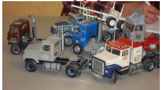
Including Chevy, Peterbuilt and White trucks.

Paul Heber: Lots of big rigs again this month.