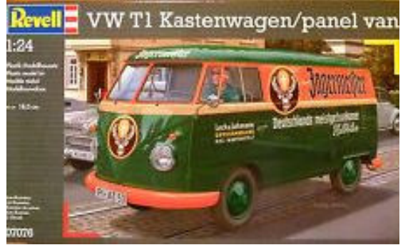
Description: VW T1 Kastenwagen/Panel Van Mfg : Revell Germany Kit :07076 Scale: 1/24 By: Chuck Herrmann

While not exactly a new kit, the VW Panel Van, or Kastenwagen, was not released in US packaging so it took a while to see these on local shop shelves. This kit is a modified reissue, based on Revell Germany's new tooling VW 23 Window T1 Samba bus kit released 2 years ago.