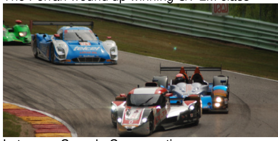
Late race Canada Corner action.

There were six yellow flags for about 45 minutes. So the final results show 25 cars on the lead lap! That is more like NASCAR than a sports car race. This included all the GTLM cars, and some Prototype Challenge cars beat bigger prototype cars due to pit stops and lack of green flag racing. It did bunch the field and kept things close.