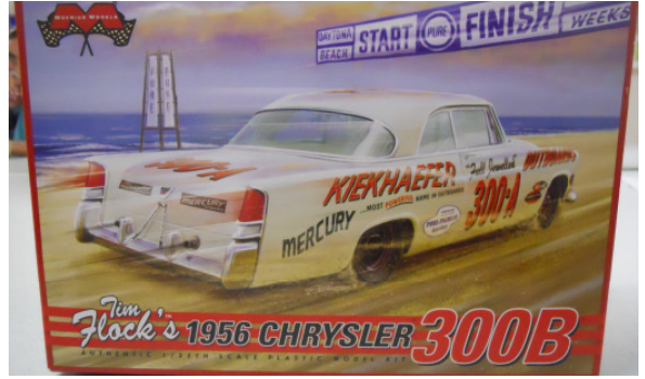
Dave also had the latest Moebius Models release of the 56 Chrysler, vintage 1956 NASCAR