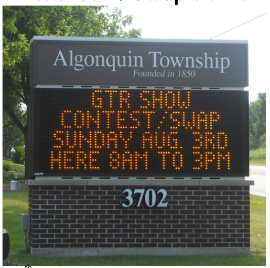
The 7<sup>th</sup> Annual GTR Summer NNL was held Sunday August 3 at the Algonquin Township Building in Crystal Lake, IL. By any measure it was a success!