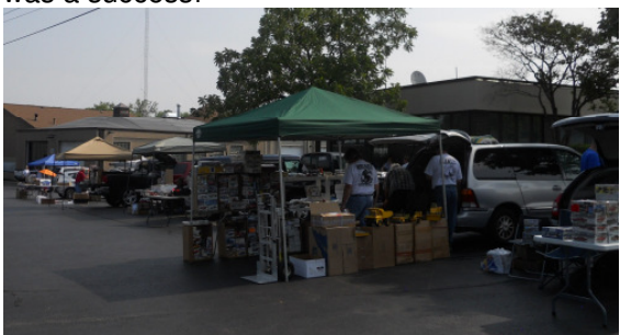
The weather was great, low 80's with no rain so the outdoor vendor Trunk Sale was busy with lots of customers and sellers.