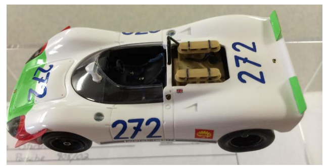
1/43 Porsche 908