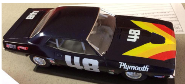
Best Pony Car - Racing : David Thibodeau, 1970 AAR Cuda Trans Am