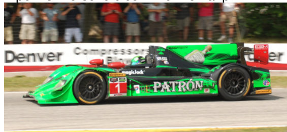
Patron Honda heading into Turn 6.