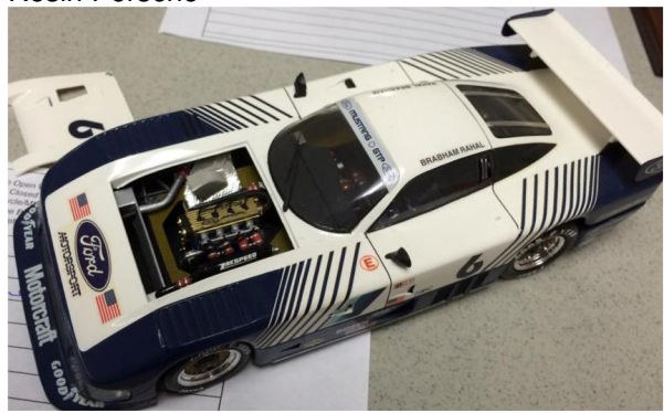
Resin IMSA Ford Probe GTP