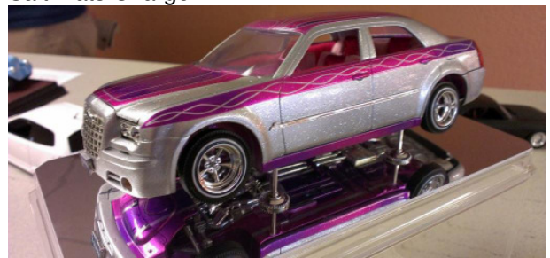
Great paint job on a Chrysler 300