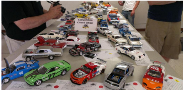
The contest tables were full. We had 238 entries from 32 modelers, both event records.