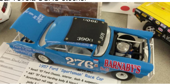
1957 Ford short track stocker.