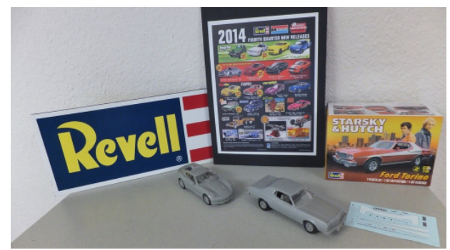
Revell was on hand with test shots and their latest kit announcements.