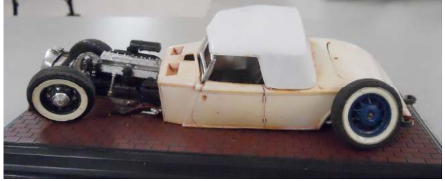
Dave Green: Dave brought in a lot of stuff purchased at the Wheaton swap meet,