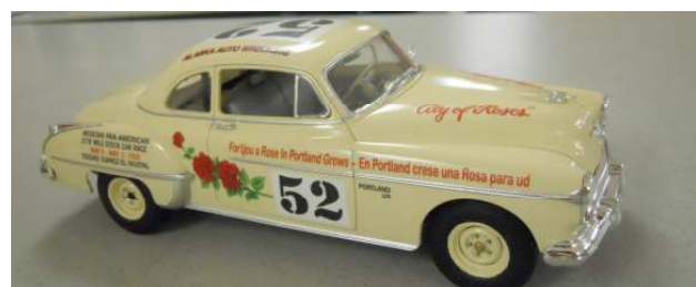
Chuck Herrmann: a Rockford show purchase of a Heller Porsche 917 build up, a weathered version of the 1970 Daytona 24 Hours winner. . Actually this was built by the first GTR president Travis Russ in the early 90's, then passed along until it was for sale as a broken built up model. Now it is restored and back in the "family".