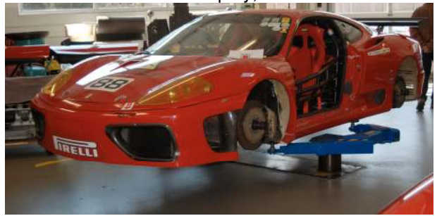
There were classics and modern Italian cars in the shop area,