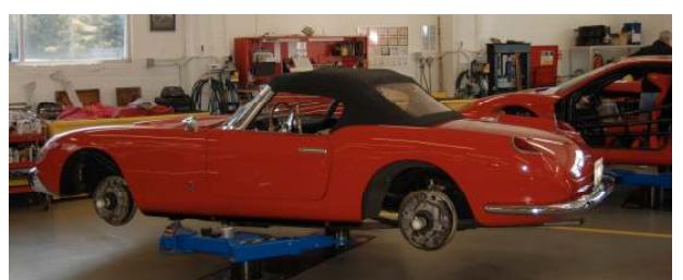
The repair area was cleaned up and lots of beautiful cars were on display,