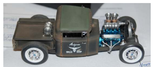
Winning Custom Entry