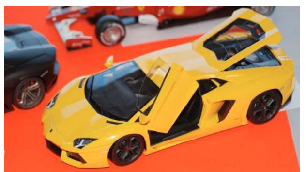
There were three of the new Lamborghini Aventador models in the show.