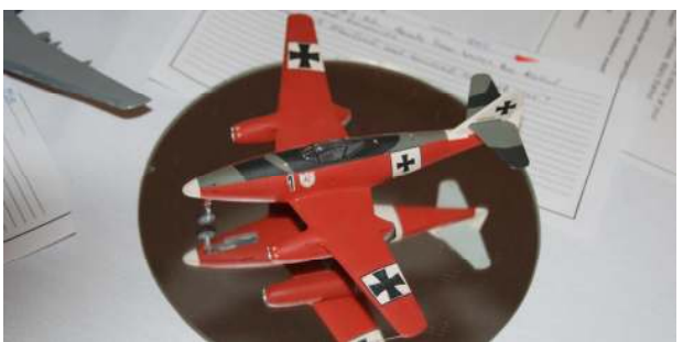
Thanks to the IPMS/Mad City Modelers for hosting this event.