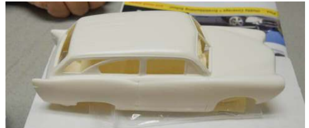
Also a resin Henry J wagon body.

The most notable was this AMT 1970 Trans AM racing Javelin. This also was released as a JoHan kit.