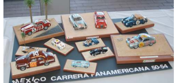
Special Carrera Panamericana display.