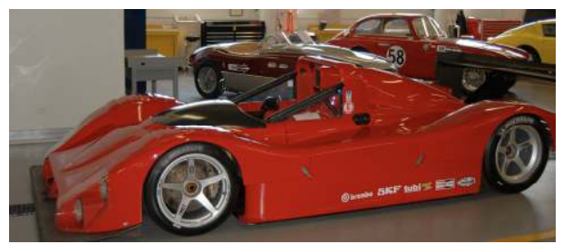
The great thing about Ferrari Expo is the real cars on display, in the show and around the dealership. Note the Ferrari 333Space car!