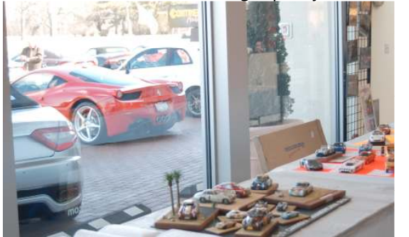
Check out the view beyond the window!

This features a small but extremely high quality contest for racing and GT style subjects. The model count was down a bit this year but what was there was usual high quality.