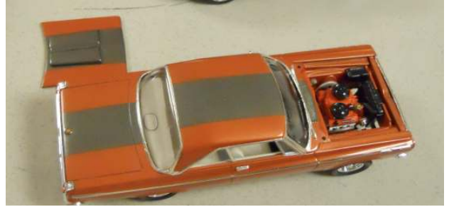
along with painted bodies of the Revell 599 Superamerica and a Ferrari 612.