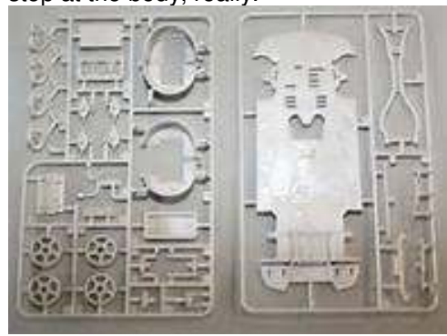
Engine : There are only 15 parts including the air cleaner/ducts, but they are very detailed and totally different from the Fiorano. Only the cam covers look similar.

Chassis: The chassis was the first thing that caught my eye as different. The Fiorano had a chromed exhaust heat shield and exhaust pipes; the shield is gone but the pipes are there and the mufflers with drilled tips are there as well. The A-arms have been modified but are still non-descript. The spindles, tie rod, shocks, wheel