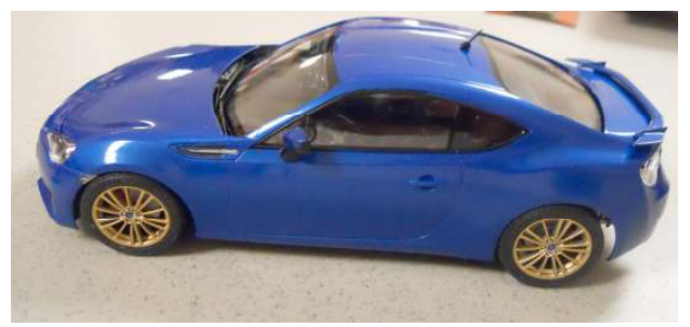
Also a built Polar Lights 65 Dodge and a built Revell Ferrari California,