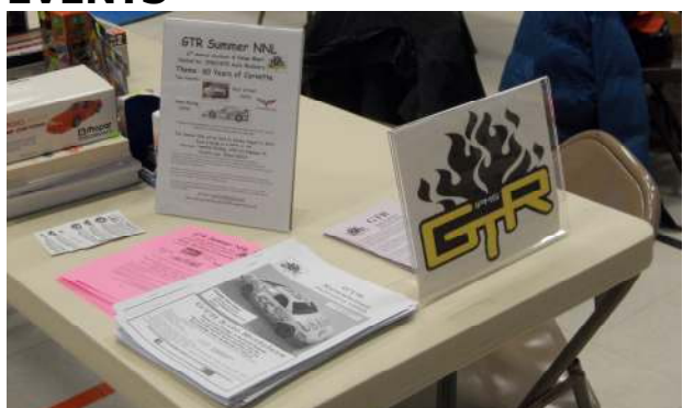
GTR was at the Rockford Classic Plastic Swap in January.

Either because of an impending ice storm or maybe the lateness of the announcement for this year's show, attendance was way down this year. Our club table was half empty, but we did get the word about the Summer NNL. That said, personally I sold a lot and picked up some neat stuff, coming out even so that was good.