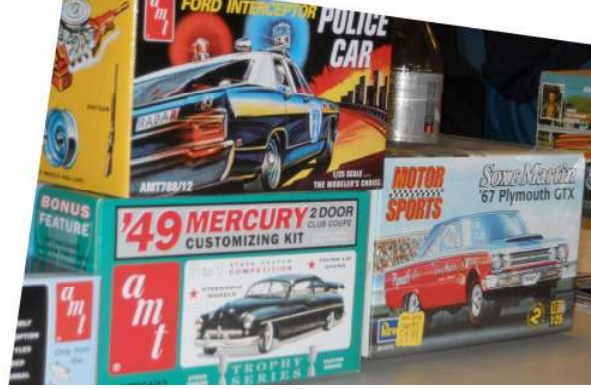
Also the Revell Challenger I,, 67 Sox and Martin Plymouth drag car and an MPC 71Challenger vintage kit bought at Rockford the week before.