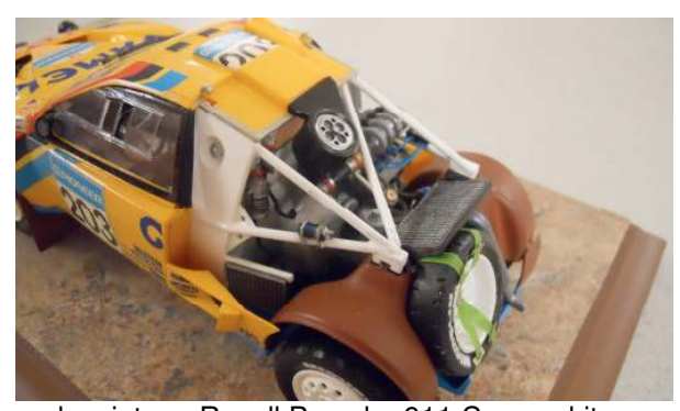
and a vintage Revell Porsche 911 Carrera kit