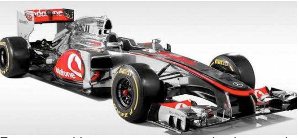
For more kit announcements check out the Hobby Link Japan website: www.hlj.com