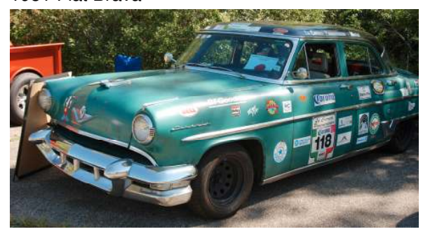
1954 Lincoln for the Carrera Pan Americana