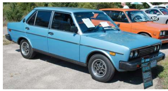
1981 Fiat Brava

There were a lot of interesting cars on display, here are a few favorites.