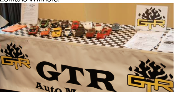
GTR has our usual display table.