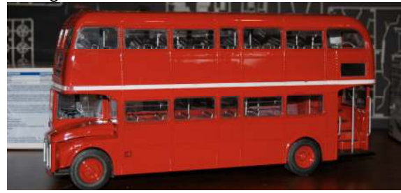
A built up example was on display on the Revell table at the Milwaukee NNL.

From all available references this kit is spot on, just like Revell Germany's other truck kits. A quick tape up of the parts indicates that it looks right, so I shall call it good. I think this kit will be a bit of a challenge to assemble, but test fittings indicate that there should be no significant problems. The sheer number of parts will eat a fair bit of time, but items such as separate window frames will ease painting. Revell Germany's typical booklet instructions run through 90 steps from start to finish. My only niggle with the kit so far is that the AEC AV590 9.6 litre engine is identified as a Leyland unit throughout.