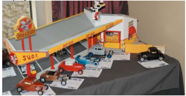
The AMG club display featured their McDonald's diorama and 32 Fords.