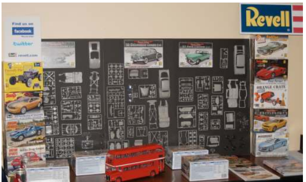
Revell had several of their newest releases on display.