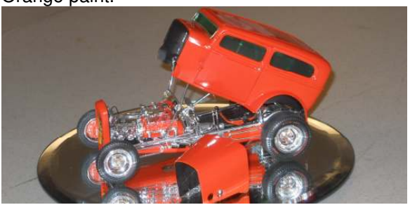
Doug DeMars : Built models of the Monogram BadMan 55 Chevy.....

Mark Minter: a real nice buildup of the classic Revell Orange Crate kit, with Clear Orange over Orange paint.