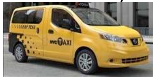
The new 2013 Nissan NV will be the "spec" cab for all future new NYC cabs.