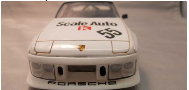
It really helps it to stand out.