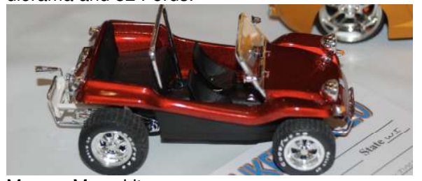
Meyers Manx kit