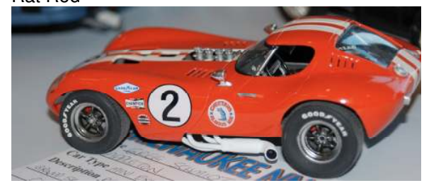
Mini Exotics Cheetah