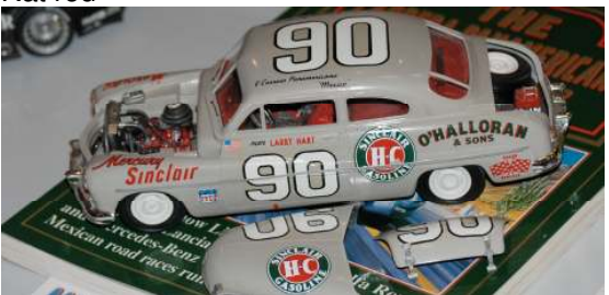
Vintage Carrera Panamericana racer.