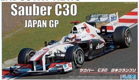
The next new Fujimi 1/20 F1 kit will be the 2011 season Sauber C30, due out late May.

Belgian kit manufacturer Similr has announced a 1/24 injection molded kit of the 2011 Pescarolo LMP1 racer from Lemans.