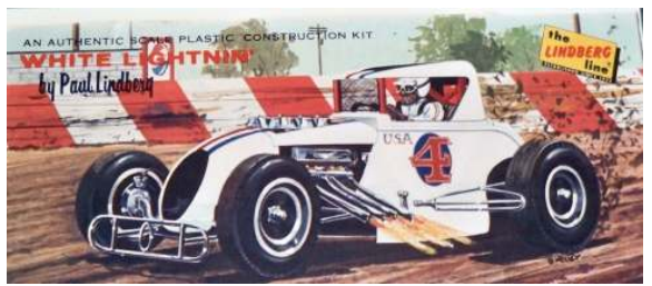
These kits (I assume reissues?) will be soon available from Lindberg.

There are a lot of kits that will fit our 2012 GTR theme of DIRT. So even if you don't necessarily build off road kits, I will publish several pictures and suggestions over the coming months, for kits that are eligible for the theme for inspiration!