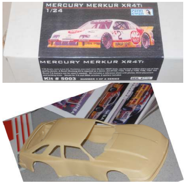
Also Tim brought in a resin trans kit to do a Trans Am/GT1 Merkur from the 80's and the recent Belkit WRC Peugeot kit in 1/24 injection molded plastic.