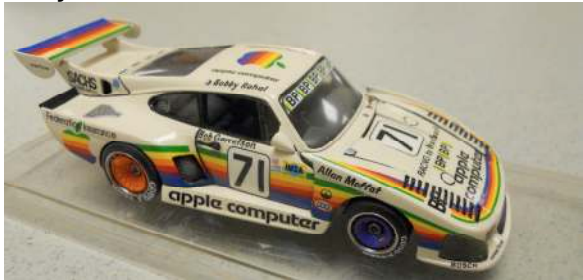
A 1/43 Porsche 935 completed kit in Apple Computer colors.....