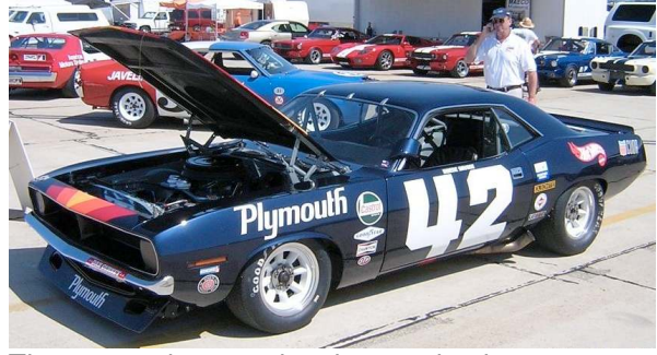
The restored car on the vintage circuit.