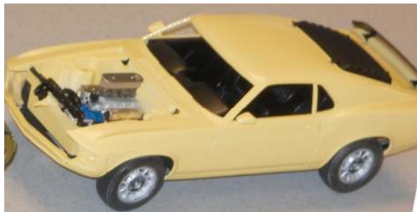
Larry Fulhorst: 1/18 70 Cuda Trans Am die cast – see cover photo.

Chuck Herrmann: for Halloween, five Batman models: the new Polar Lights 60's TV show 1/25 Batmobile, the old 1/32 Polar Lights repop of the Aurora 60's kit, a 1/64 Ertl diecast kit of a 40's Bat Gyro, a Bat Coupe built from a Testors Alumacoupe kit, and a resin Batman figure.