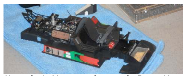
Also a Scale Motorsport Corvette C-6R transkit (for the Revell kit) to do up a very detailed model. Nice machined wheels.