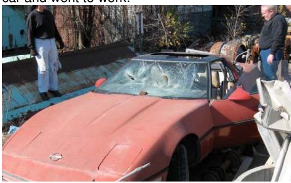
The before picture.....

all this money to race in the Barber Series. So, we decided to find a car, convert it to a race car and go racing economically and have fun while doing it. The result was a Corvette that we got for peanuts, and found another one for a donor car and went to work.