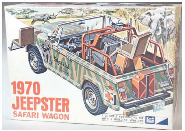
Rally Cars – lots have been built by Tamiya, Hasegawa, Esci, Revell etc. Baja and Dakar rally cars are definitely off roaders.