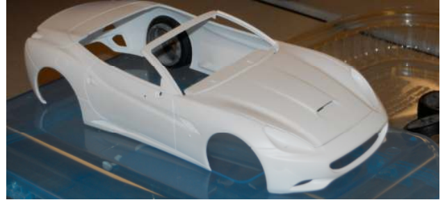
Photo etch bits and resin wheels....