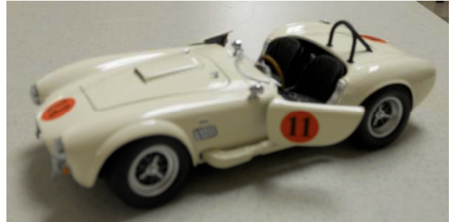
And a recent auction purchase of a Monogram Circle Track two in one kit.