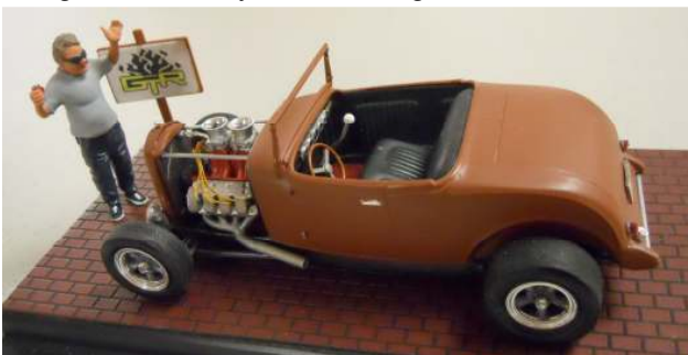
And another swap meet bargain, a $1 radio control Porsche 356 being converted to a slammer Carrerra Panamerica racer using Scale Design decals.