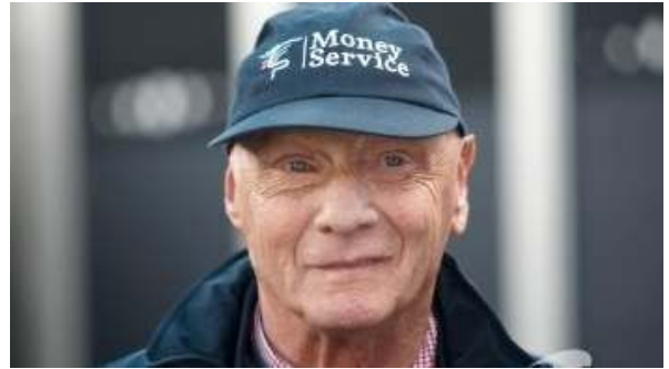
Nikki Lauda, his crash at the Nurburgring- below

Last month we saw that the movie Senna is now being released worldwide. Now we hear that work on a screenplay to immortalize F1's 1976 season in process. 35 years ago, Austrian great Nikki Lauda almost burned to death in a fiery crash but returned six weeks later to battle James Hunt for the title. The movie is to be titled Rush .