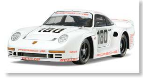
Also see the Hobby Link Japan website for news and videos. www.hlj.com

Tamiya ; will reissue the Porsche 961 race car from LeMans 1986, the same easy build kit seen previously.