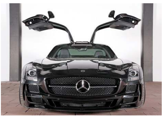
(Ed. Note: Mercedes has announced that there will be a roadster version of the SLS – it looks pretty hot! I am sure we will see this in kit form shortly...)

Decals : Besides the aforementioned ones, there are no less than 10 pairs of license plates to choose from; maybe a little excessive. The emblems and scripts are all supplied as decals. For good pictures you can look in the July 2010 issue of Road & Track or Nov 2009 issue of Car & Driver .