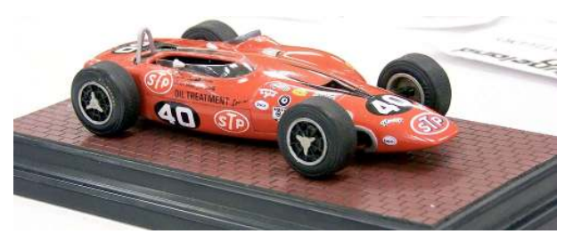
MPC did a 1/25 version of the 1968 STP Lotus wedge turbine, it was last reissued about 8 years ago in a plain white version.

As for racing turbines, the most famous was the 1967 STP Turbine, which was done in 1/20 by MPC and in a big scale 1/12 version by Bandai, both are hard to find. There was a 1/24 resin version, by Jorgensen Resin Cars, that is also pretty rare, I started one for the 2000 GTR Project Resin that I finally finished last year.