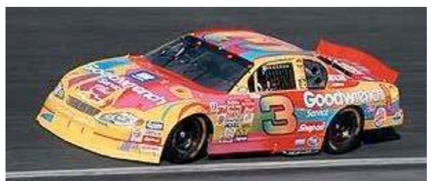
The real thing in action.