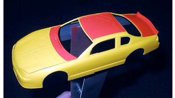
Photo 3: The body shell with its base coat of yellow and red applied.

I painted the whole body shell yellow, with a red roof, trunk, and cowl (Photo 3). Then it was a matter of applying the decals---not as easy as I thought, as they didn't quite fit the body shell and I had to do a lot of trimming and brush-painting to blend in the holes and gaps left by my slicing and dicing. (Photos 4 and 5). All the pastel colors frankly gave me fits, trying to match their colors, but sticking with it eventually produced a body shell completely covered with color. I used Gunze Sangyo acrylics for the whole build.