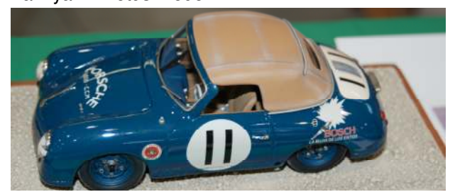
The contest theme was the Mexican Carrera PanAmerica races fom the 50's.