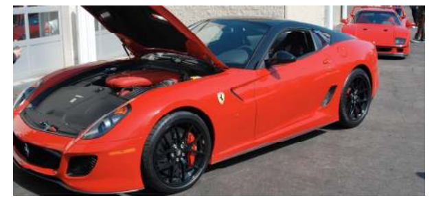
The new Ferrari GTO!