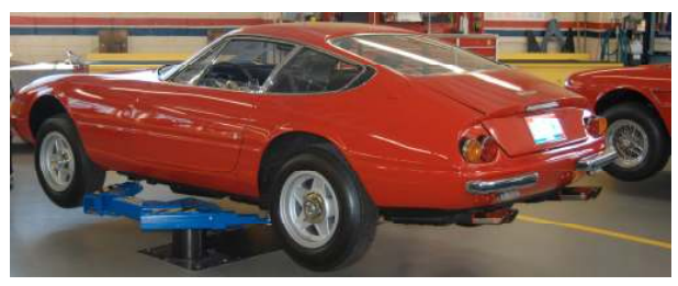
Classic Ferraris in the shop.