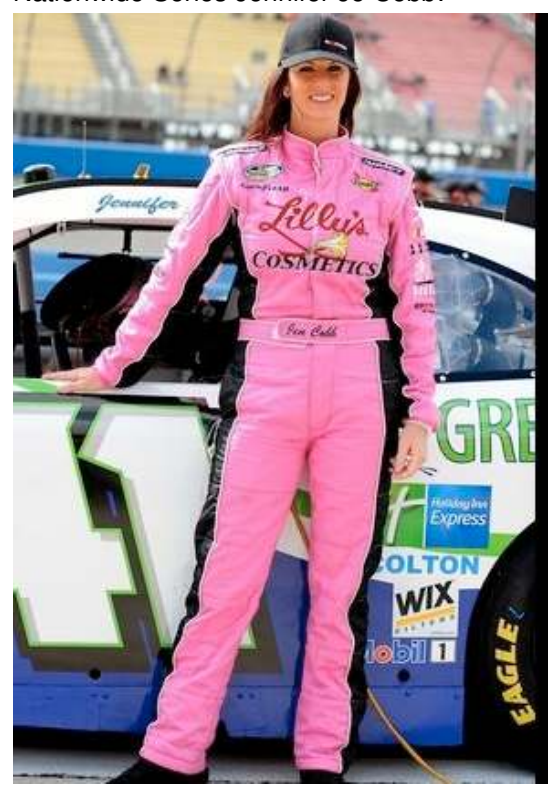
They don't make stock car drivers like they used to.....a PINK drivers suit?