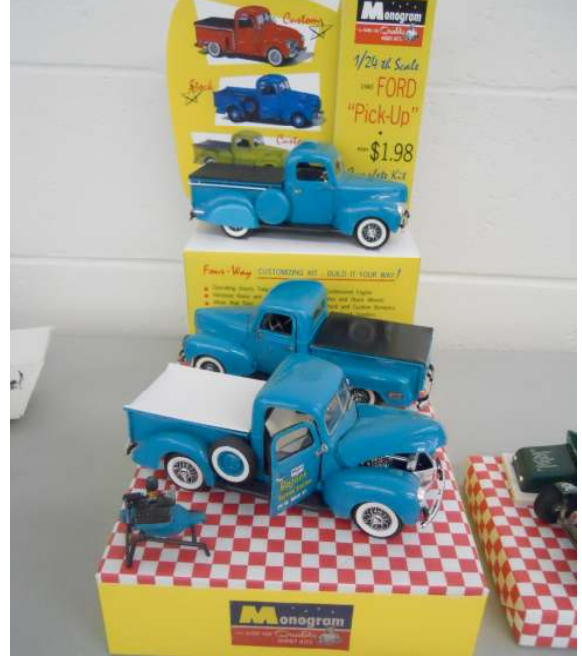
Wheaton shows. Most of the subject matter for sale and in the contest tended to be more custom

The 2011 Cedarville Toy Show was Sunday, March 13 in Cedarville, IL, just north of Freeport. I had heard the show was a growing event over the last few years, so I decided to check it out this year. The swap meet is huge, rivaling the