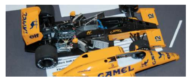
Tamiya F1 Lotus model.