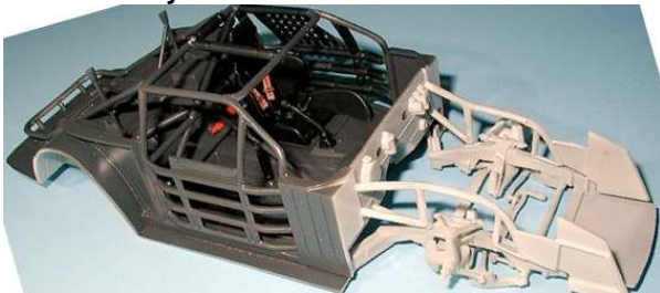
Of course, once I got the whole thing together, all this couldn't be seen. Doesn't that figure.