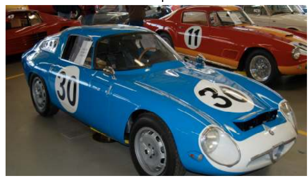
The Expo is always a great way to spend a day, beautiful models and exotic Italian cars!

Thanks to Continental Auto Sports for hosting a great show, and to Tom Tanner/Scale Designs for putting together a nice contest.