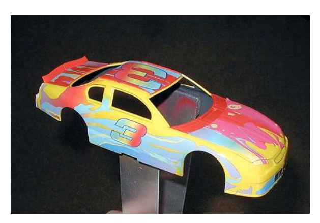
Photos 4 & 5: Careful trimming of the decals was required to get them to conform to the body shape. Then patient color matching to fill in the gaps.

I painted the whole body shell yellow, with a red roof, trunk, and cowl (Photo 3). Then it was a matter of applying the decals---not as easy as I thought, as they didn't quite fit the body shell and I had to do a lot of trimming and brush-painting to blend in the holes and gaps left by my slicing and dicing. (Photos 4 and 5). All the pastel colors frankly gave me fits, trying to match their colors, but sticking with it eventually produced a body shell completely covered with color. I used Gunze Sangyo acrylics for the whole build.