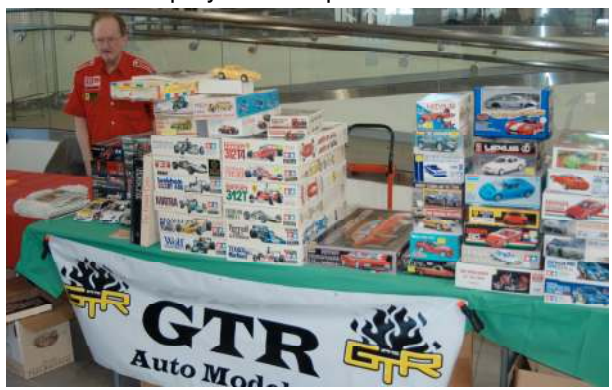
There were some nice models in the contest.