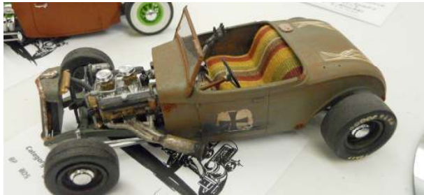
The rat rod genre was well represented.