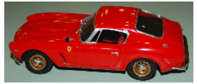
Revell 308, in red