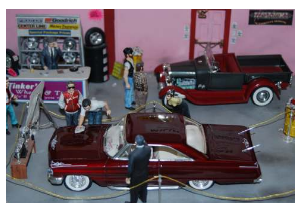
GTR Auto Modelers Newsletter