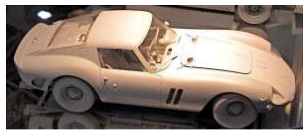
New Ferrari GTO kit from Fujimi.

For all the photos, check out the Hobby Link Japan webpage <a href="https://www.hlj.com">www.hlj.com</a>