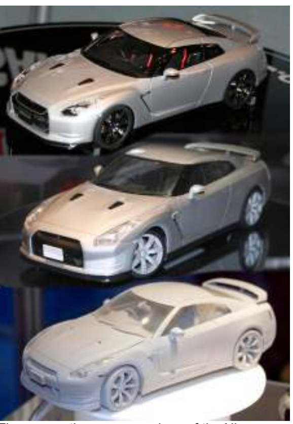
There were three new versions of the Nissan GT-R by Aoshima, Tamiya and Fujimi.

There were several new releases of both major manufacturers and the aftermarket companies. Also there was a club area, 155 clubs were there. How about a GTR road trip next year?