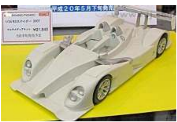
Studio 27 Porsche RS Spyder 2007 – multi media kit, nice but $207 retail?